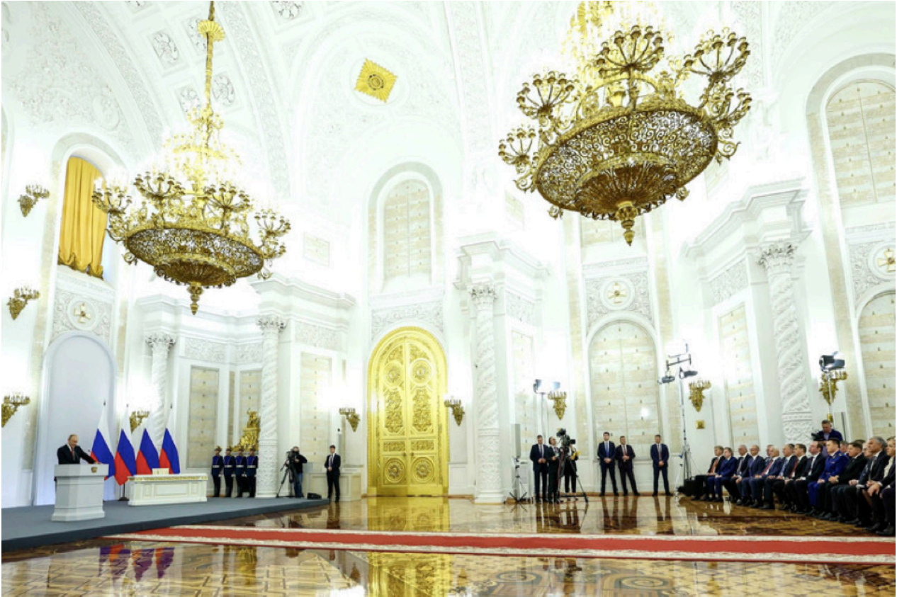
Signing ceremony for the accession of the Donetsk and Lugansk People's Republics and the Zaporozhye and Kherson Regions at the Grand Kremlin Palace's St George Hall

“Meanwhile, the West continued to look for another chance to strike a blow at us, to weaken and break up Russia... to set our peoples against each other and to condemn them to poverty and extinction. They cannot rest easy knowing that there is such a great country with this huge territory and its natural wealth, resources and people who cannot and will not do someone else's bidding.