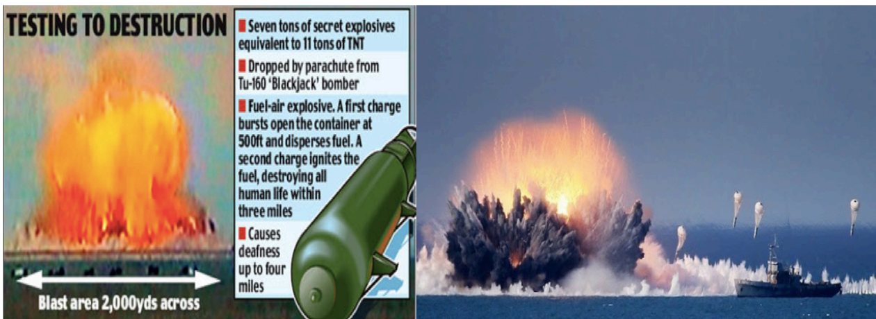
FOAB dropped from a Tu-160 bomber at the Opuk training range, Black Sea in 2016; this ordnance is designed to vaporize targets and collapse structures by igniting a fuel-air mixture in midair

On the other hand, Russia’s Basic Principles doctrine does not allow for unprovoked use of nuclear weapons – tactical or strategic. In any case, Russia has absolutely no need to resort to tactical nukes as it possesses the most powerful conventional weapon in existence, nicknamed FOAB – Father of All Bombs – a thermobaric bomb with a blast yield of 44 tons TNT; more importantly, these weapons do not emit any radiation, as nuclear fallout would pose both an immediate and lingering threat to their troops as well as to local civilians – most of whom are expected to one day become loyal Russian citizens.