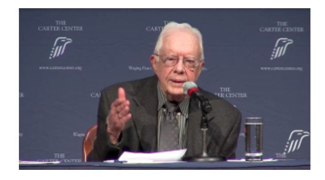
Former President Jimmy Carter

While it is impossible to predict the outcome, when taken together, the US actions seem to indicate their intent to attack the DPRK, overtly or covertly, or through proxies, though the risks are catastrophic. Only the dangerous possibility of China's involvement could deter this intent. North Korea is now being crushed economically and subjected to intolerable provocations. Although the "status quo" may appear to be in the interest of all parties, recalcitrant and irrational aggressive forces are being unleashed within US-NATO, with or without UN authorization. If US-NATO military power is permitted to obliterate North Korea, their resultant intoxication with military force, combined with their economic weakness makes it inevitable that China and Russia are their next quarry. It is imperative that Russia and China take this seriously, as they surely do. The time is long overdue for Russia and China to use their veto power. Their appeasement of US/NATO interests is short-sighted and enabling a war of possibly incalculable proportions. It is preferable to live with a nuclear armed North Korea than to die in a nuclear holocaust. Indeed, even the venerable Susan Rice factored in this option.