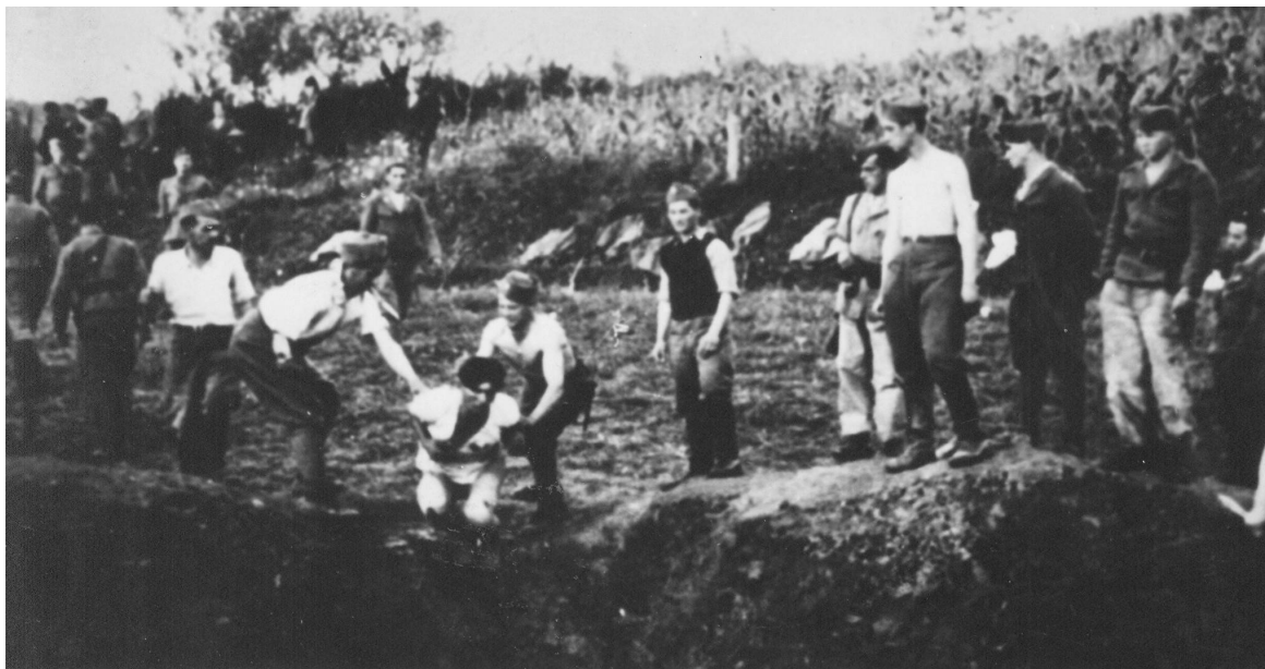
Ustaše militia executing people over a mass grave near Jasenovac concentration camp

I do not intend to offer any legal or historical arguments concerning the genocide in Croatia during World War II, leaving that task to other presenters who will be speaking today. Instead, I will narrowly focus on the issue of Srebrenica which the global political establishment holds to be a starker example of genocide than even Jasenovac. Does Srebrenica qualify as a genocide and can it legitimately replace Jasenovac as the paradigmatic Balkan genocide?