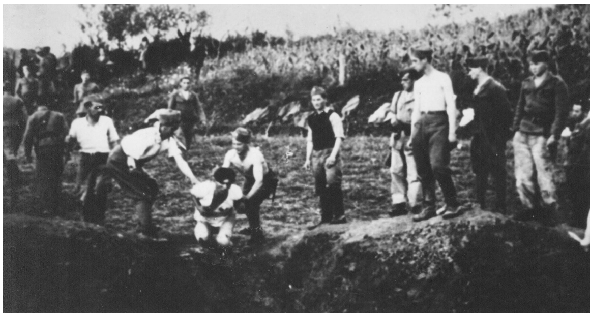
Ustaše militia executing people over a mass grave near Jasenovac concentration camp

I do not intend to offer any legal or historical arguments concerning the genocide in Croatia during World War II, leaving that task to other presenters who will be speaking today. Instead, I will narrowly focus on the issue of Srebrenica which the global political establishment holds to be a starker example of genocide than even Jasenovac. Does Srebrenica qualify as a genocide and can it legitimately replace Jasenovac as the paradigmatic Balkan genocide?