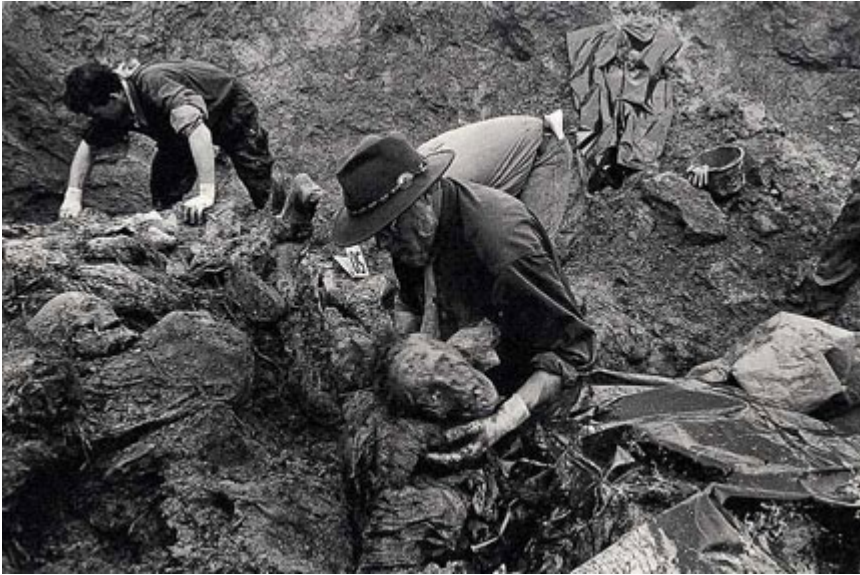
Exhumations in Srebrenica, 1996

Absent provable genocidal intent, or dolus specialis , the loss of life in Srebrenica may be regretted and condemned but it cannot be raised to the level of genocide. The defining characteristic of genocide is the intent to physically destroy one of the categories of persons, ethnic, religious, or racial, protected under the Genocide Convention. That is not in dispute. All professionals are aware of that and accept it.