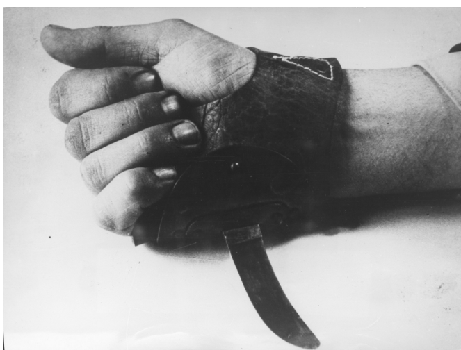
Image: An agricultural knife nicknamed "Srbosjek" or "Serbcutter", strapped to the hand. It was used by the Ustaše militia for the speedy killing of inmates at Jasenovac (From the Public Domain)

The next hard data point is the generally accepted fact that in July 1995 there were two significant causes of human losses amongst the population of the enclave. One was execution of prisoners of war, the other was combat deaths sustained by the mixed military/civilian column of the Muslim armed forces which was conducting a breakout from Srebrenica to the nearest territory under Sarajevo government control in Tuzla. In international law, execution of prisoners is a punishable war crime. Combat losses however are not subject to criminal prosecution. The Hague Tribunal has accepted the validity of that distinction and that is why it never indicted anyone for inflicting casualties on the retreating Muslim military column.