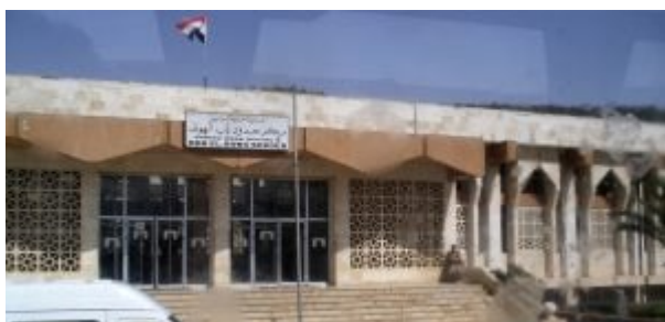
Image: Bab El Hawa boarder crossing from Turkey to Syria in March 2006. (Licensed under CC BY 3.0)

Numerous international and local organisations have expressed serious concerns about the high costs of operations, including due to sanctions-induced rising prices in fuel and the challenges to financial transactions, procurement and delivery of goods and services. They report that foreign banks are often reluctant to process payments destined for Syria, particularly following Lebanon's banking crisis and the spill-over effects on Syria. Restrictions and delays in processing payments with suppliers, which can take months, lead to a restricted and less competitive market, rising costs, putting at risk the implementation of life-saving humanitarian interventions. I have received information that important international humanitarian actors have either significantly reduced their activities or fully withdrew from the country due to these challenges, leaving a serious protection and rehabilitation gap.