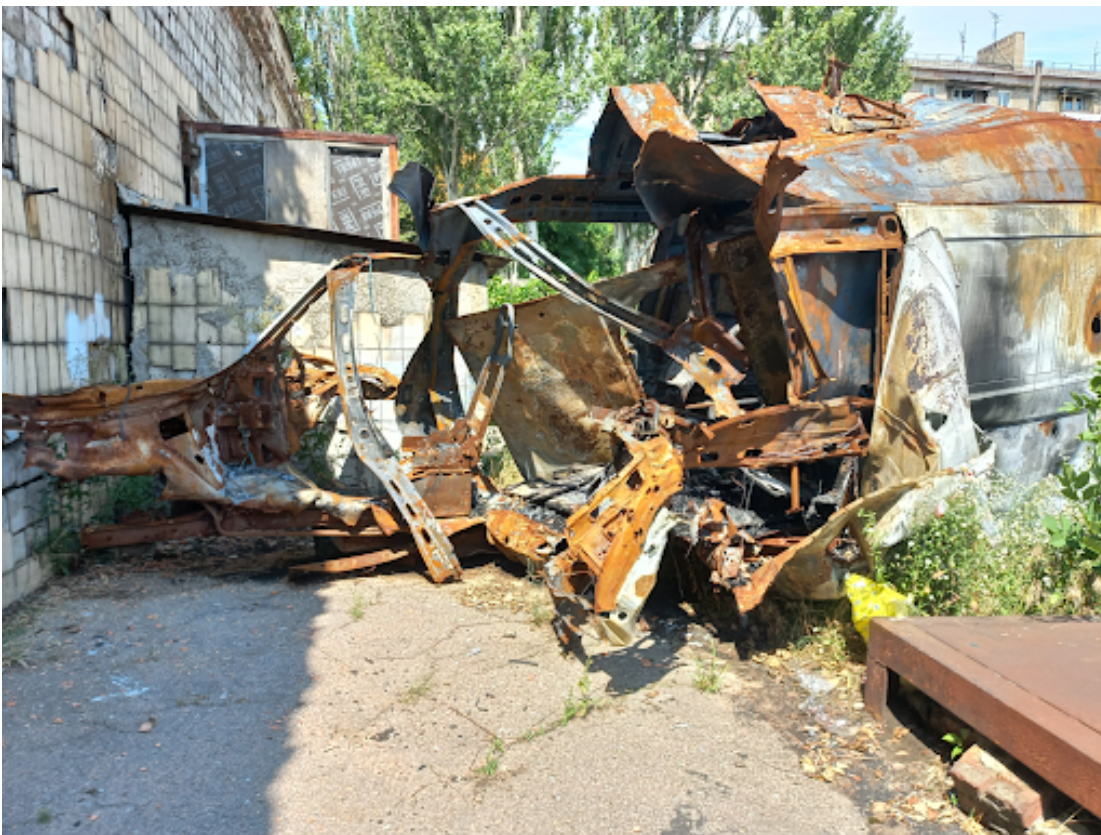
Donetsk ambulance destroyed by Ukrainian shelling while out on a call.

In early June, heavy Ukrainian shelling of Kuibyshevsky District, Donetsk, destroyed an ambulance and seriously injured the driver.