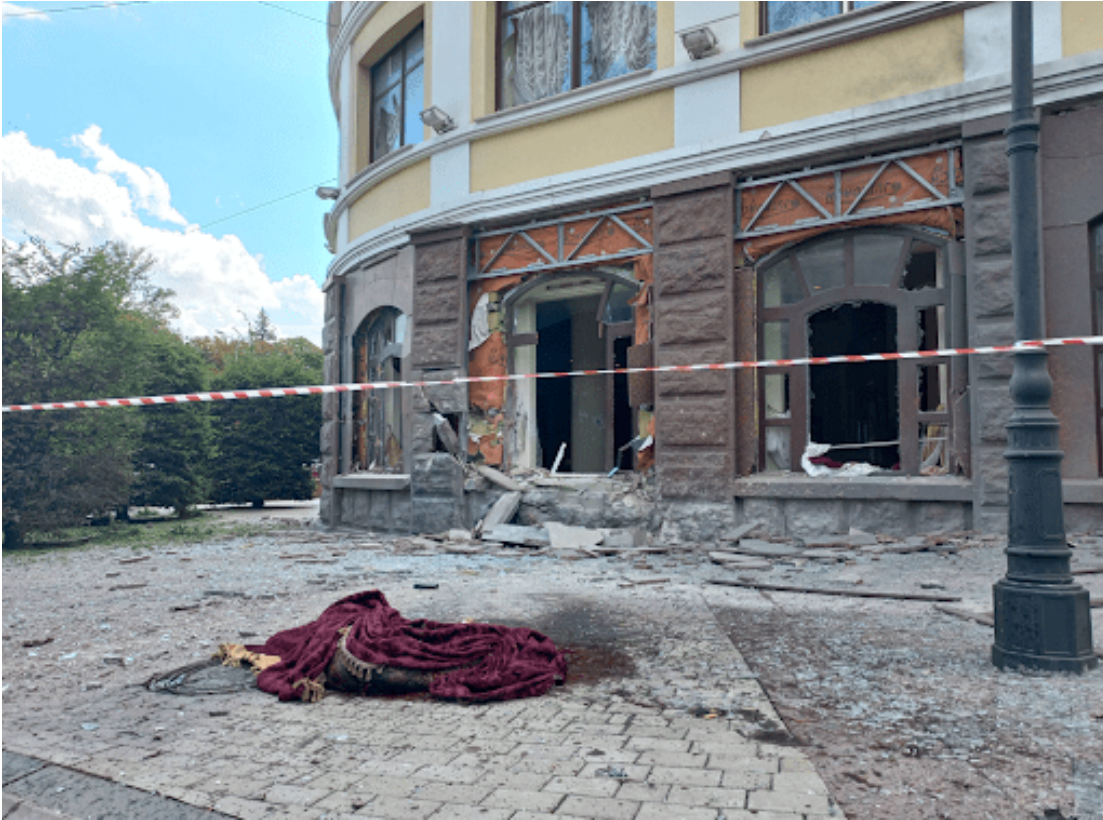
Ukraine's bombing of central Donetsk on August 4 targeted a hotel the author was in, killing a woman outside and five others nearby.

When it seemed the shelling had stopped, journalists went outside to document the damage. Sadly, a young woman outside the hotel had been killed by the shelling. Five others just two streets away were also torn apart by the bombs, including a promising 12-year-old ballerina, her grandmother, and her world famous former ballerina ballet teacher.