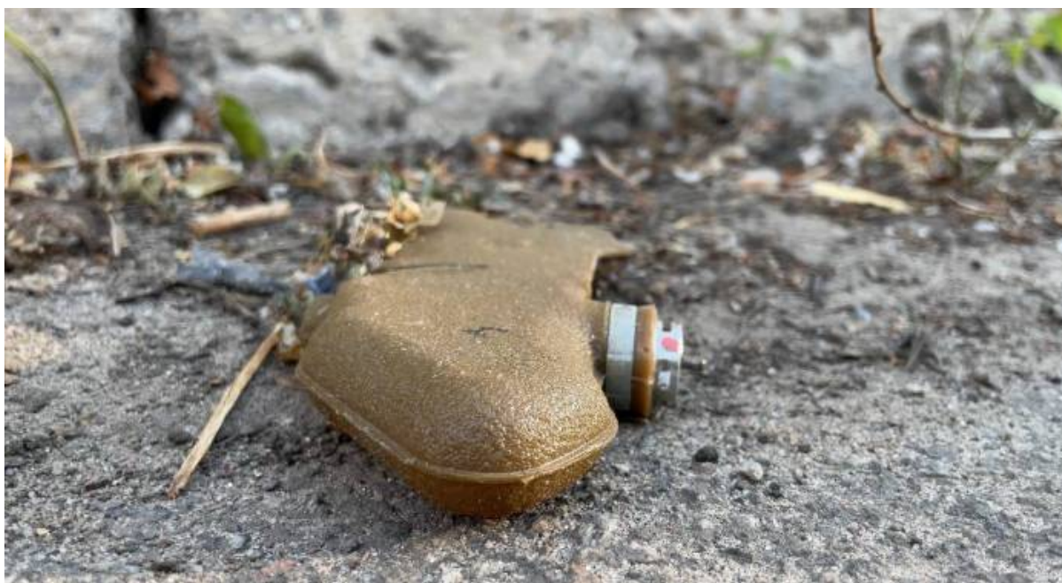
Petal mine on street in Donetsk.

I asked about the impact of the “Petal” mines Ukraine has been dropping on the city, and was told a 21-year-old employee was injured by a PFM-1S mine after a region was cleared, the mine falling from the building and the unsuspecting rescuer stepping on it, losing his foot.