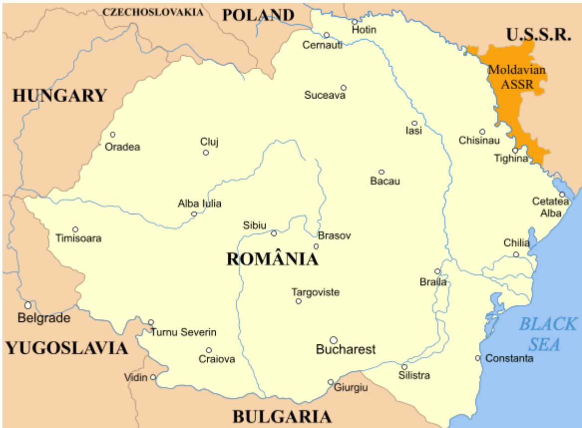
Moldavian ASSR (orange) and Romania, 1924-1940 (Licensed under CC BY-SA 3.0)