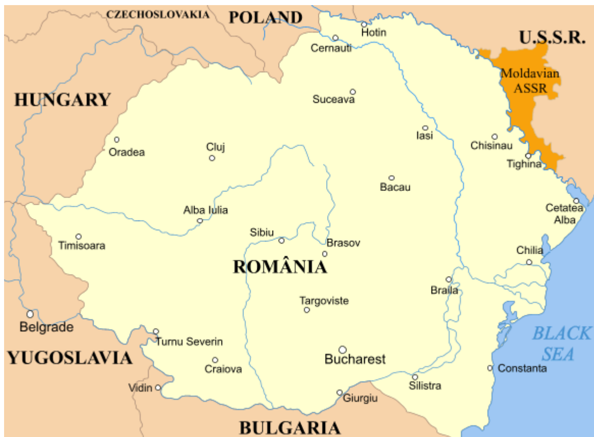
Moldavian ASSR (orange) and Romania, 1924–1940 (Licensed under CC BY-SA 3.0)