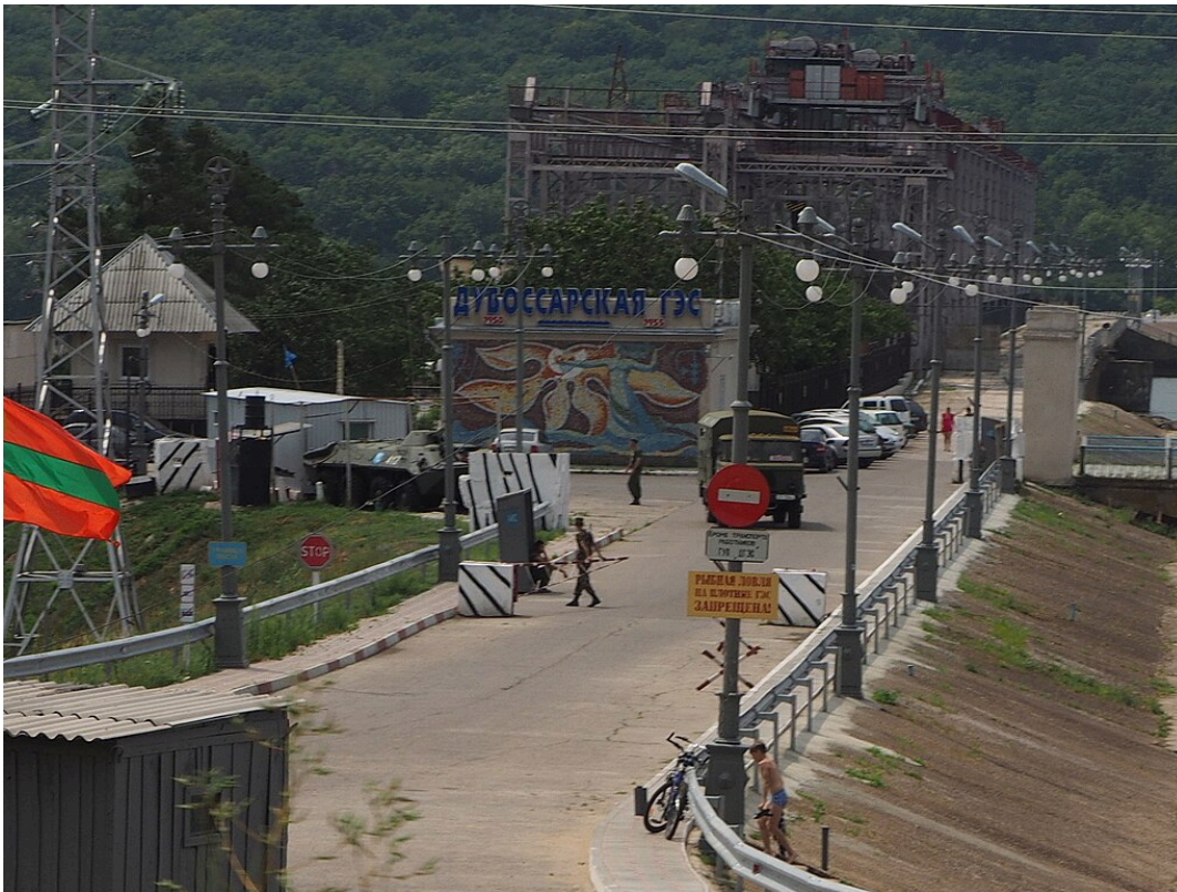
Russian peace-keeping soldiers at the border between Transnistria and Moldova at Dubăsari

The Russian military has the men and materiel to fend off the opening stages of any coming conflict here. However, when war does begin near Odessa the base located in Cobansa, Transnistria will certainly need additional support quickly. Here lies the first important conflict.