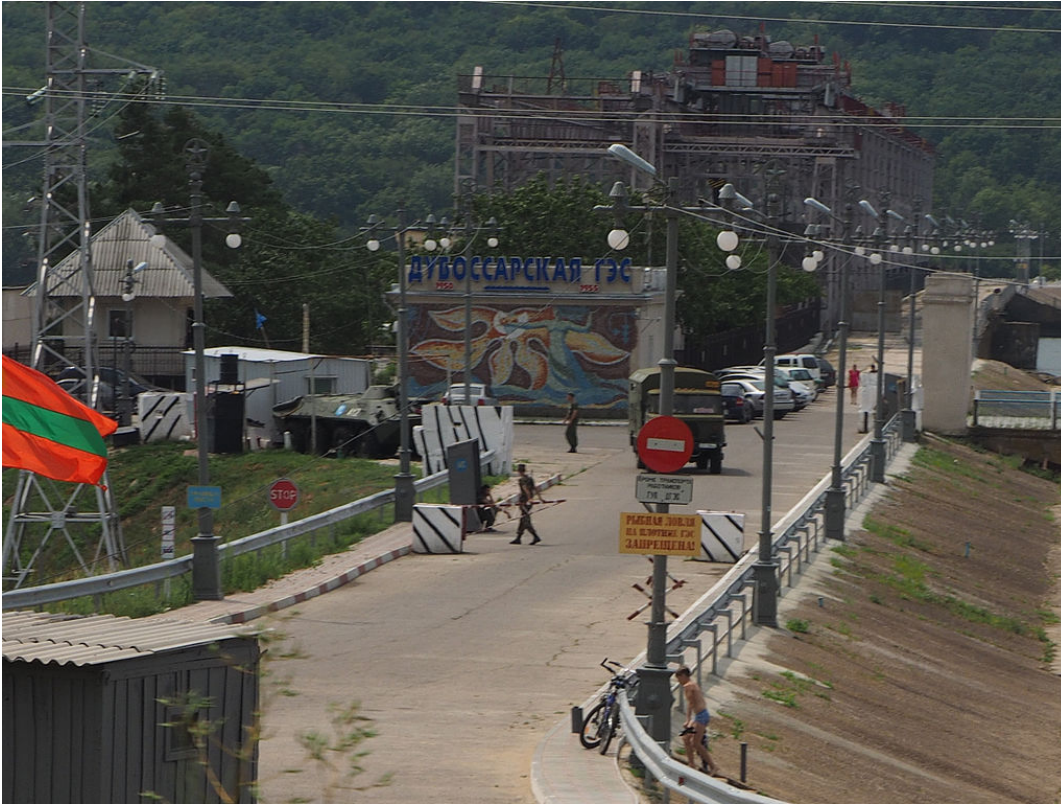
Russian peace-keeping soldiers at the border between Transnistria and Moldova at Dubăsari

The Russian military has the men and materiel to fend off the opening stages of any coming conflict here. However, when war does begin near Odessa the base located in Cobansa, Transnistria will certainly need additional support quickly. Here lies the first important conflict.