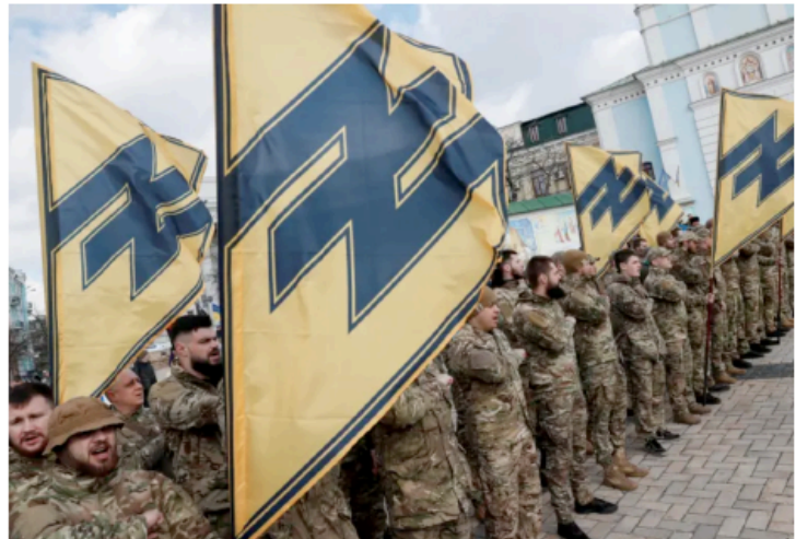
Nazi SS Wolfsangel symbol and Ukrainian Azov battalion boasting the same symbol

These symbols, including swastikas, actually abound, but the corporate media scrubs them with a surfeit of fervor so that we can all maintain the fantasy that we are saving democracy and freedom at any cost.