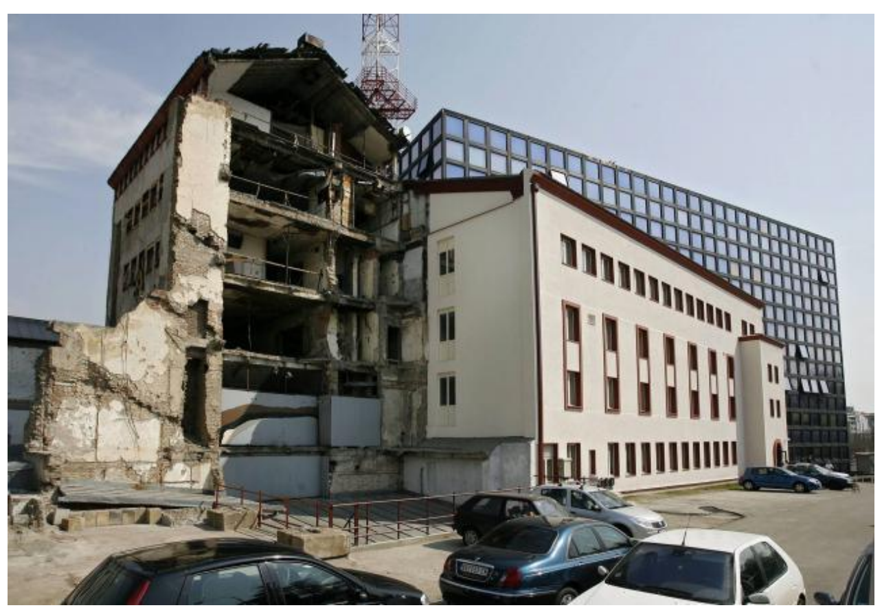
The Radio Television of Serbia building in Belgrade