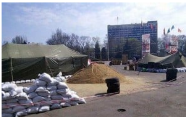
Anti-fascist tent camp on Kulikovo Field, Odessa, April 2014.

With this goal, fighters from the special task force Vostok (East) and Storm battalions, sponsored by Ukrainian multi-billionaire Ihor Kolomoysky , were brought into the city dressed in civilian garb. The so-called “14 th company of Euromaidan Self-Defense Force” from Kiev, which had been actively involved in the riots in that city on April 29 , was also involved.