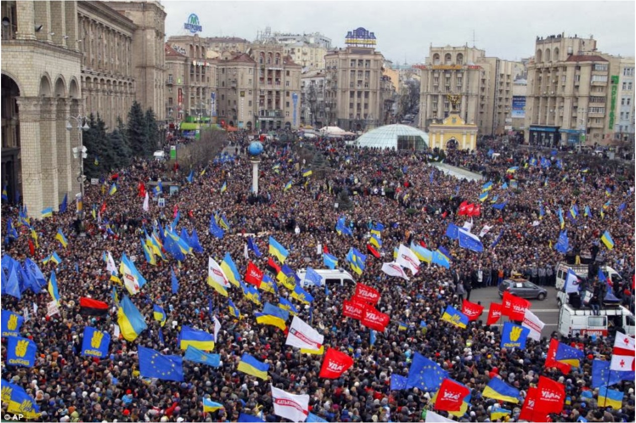
Image: Neo-Nazi flags unfurled side-by-side with the European Union's - with the revised 3-fingered salute on Svoboda's party flag, the familiar Nazi black and red of "Right Sector," and flags of the Hitleresque "Fatherland Party," all hidden in plain sight in front of the world. The Western media's selective omissions and its intentional failure to investigate and expose the true nature of an opposition they portrayed as "pro-democracy" and "pro-West" helped build international support for a movement the global public would otherwise have recoiled in disgust from.

Svoboda was officially linked to paramilitary organizations until as late as 2007, and is still loosely affiliated with them. The organization has attempted to "soften" its image, or in other words, bury its extremist ideology under a moderate facade to covertly move it forward.