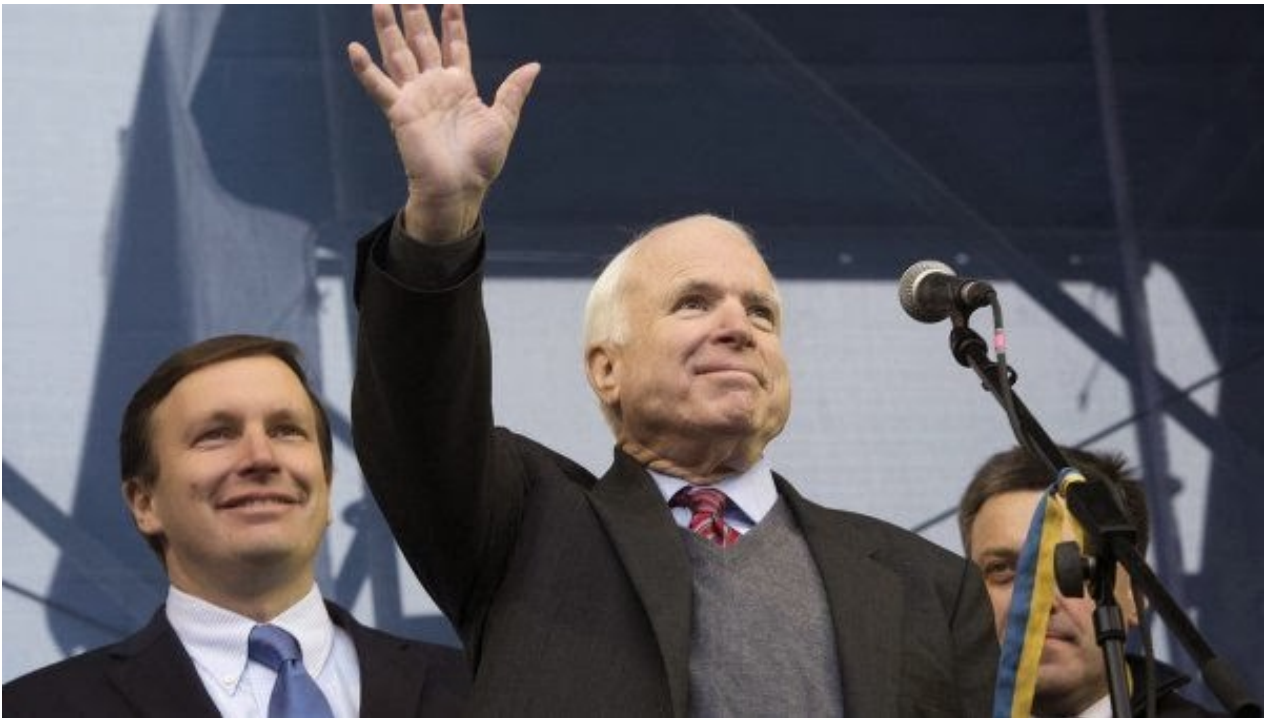
Image: US Senator John McCain in Kiev flanked on his left side by overt Jew-hater and Svoboda party leader, Oleh Tyahnybok. The West’s willingness to ally itself with violent bigots, racists and literal Nazis exposes its “values” as nothing more than a selectively upheld facade easily disposed of when inconvenient – and entirely designed to couch its true, corporate-financier driven hegemonic designs behind.

Astonishingly, it would be overt Jew-hater Oleh Tyahnybok that US Senator John McCain would share the stage with in Kiev during the climax of “Euromaidan” in support of the “pro-European” mobs.