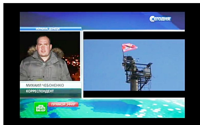
Novorussian flag over Debaltsevo

That the forces in the Debaltsevo cauldron were doomed was pretty clear for a while already, but what is still amazing is the speed at which the collapse has taken place. Clearly, we are dealing with a catastrophic collapse of combat capability of the junta forces.