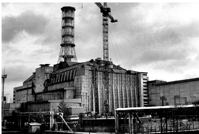
Image: Chernobyl today is still an ongoing danger.

threat to one or more of Ukraine's 15 nuclear reactors might give NATO the pretext necessary to deploy troops into Ukraine, particularly in the east where Kiev is unable to assert control. While NATO cannot justify intervening in Ukraine's internal political crisis directly, it may attempt to make a case that a nuclear catastrophe directly threatens NATO members.