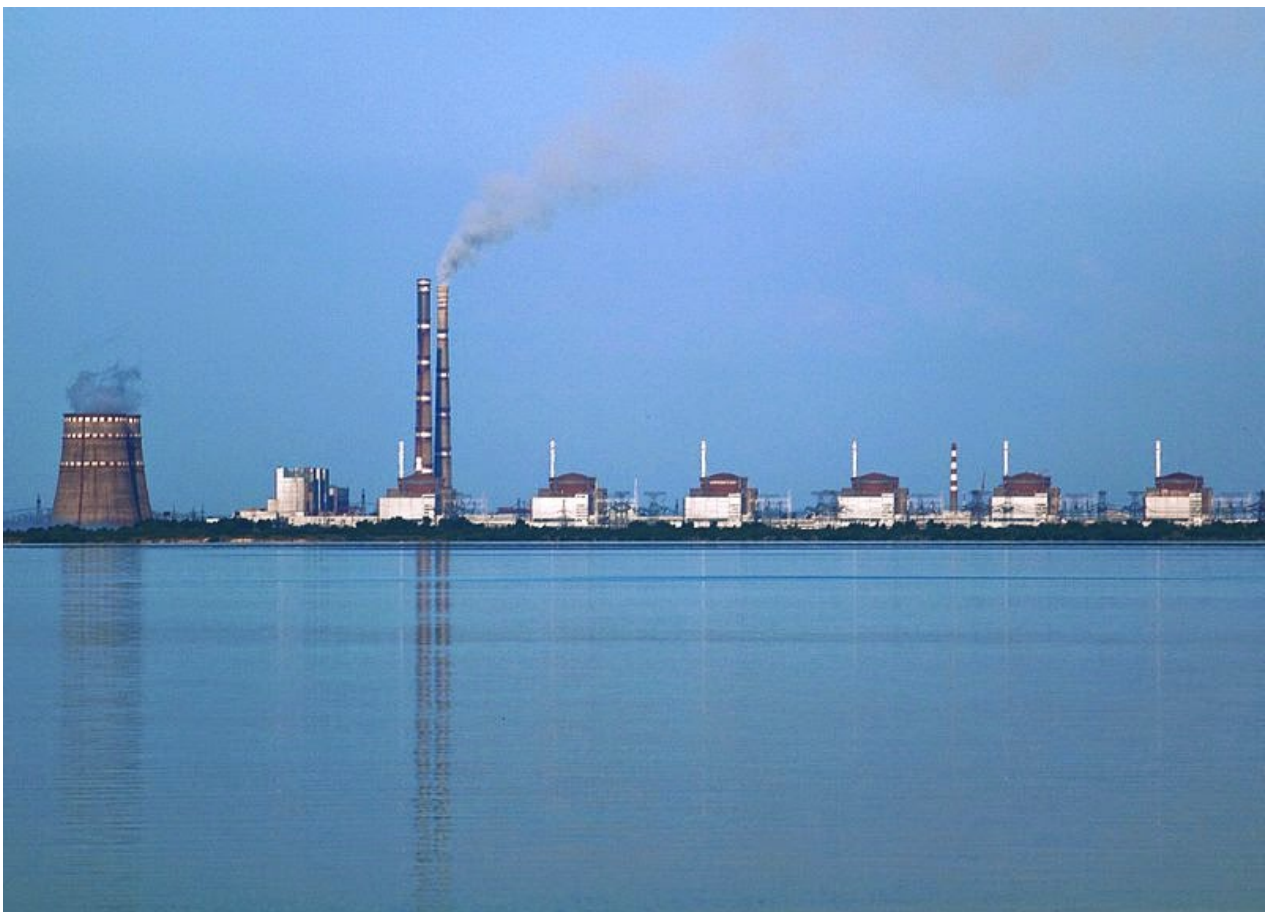
Image: Ukraine's Zaporizhia nuclear power plant with its six reactors is the largest in Europe and the fifth largest in the world. With the Chernobyl disaster in hindsight, 20 Neo-Nazi militants from Right Sector attempting to storm the facility constitutes a threat to much of Europe and western Russia – a threat NATO may be fabricating to create a pretext to more directly intervene in Ukraine.

Policemen of the city of Energodar have detained 20 activists of the Right Sector, who tried to seize the Zaporozhye NPP. According to the leader of the Zaporozhye branch of the organization, the militants were afraid that the city would fall in the hands of supporters of federalization.