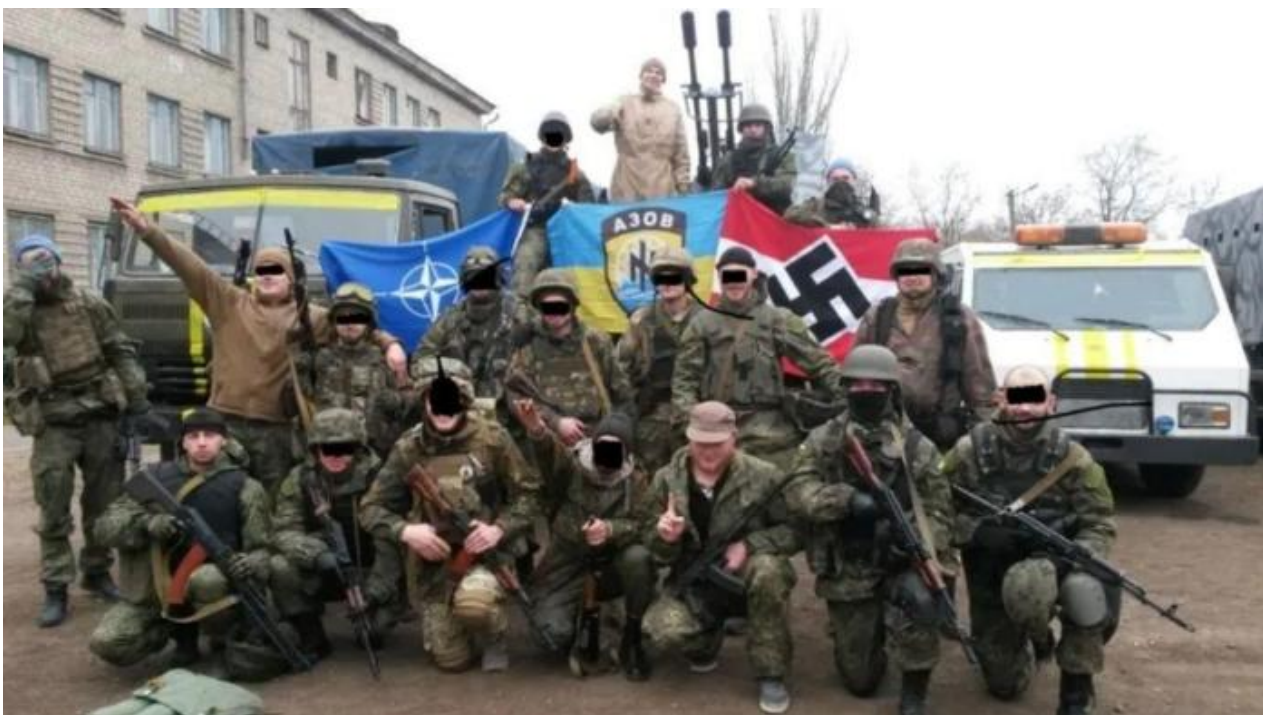
Azov Battalion fighters with NATO flag at left and Nazi flag at right.

Notably, this call for ethnic cleansing does not cite the Germans then occupying Ukraine, yet the fascist and neo-Nazi propagandists who are waging a war in the Donbas region today portray their forebearers as heroes for having defended Ukrainian nationalism from the Soviets and Germany. The Pentagon successfully pressed Congress to lift restrictions on training and providing military assistance to groups, such as the Azov Battalion, that are based on fascist or neo-Nazi ideology.