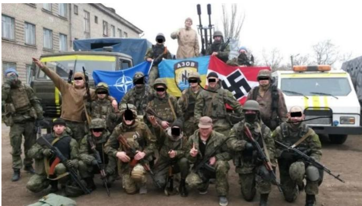
Azov Battalion fighters with NATO flag at left and Nazi flag at right.

Notably, this call for ethnic cleansing does not cite the Germans then occupying Ukraine, yet the fascist and neo-Nazi propagandists who are waging a war in the Donbas region today portray their forebearers as heroes for having defended Ukrainian nationalism from the Soviets and Germany. The Pentagon successfully pressed Congress to lift restrictions on training and providing military assistance to groups, such as the Azov Battalion, that are based on fascist or neo-Nazi ideology.