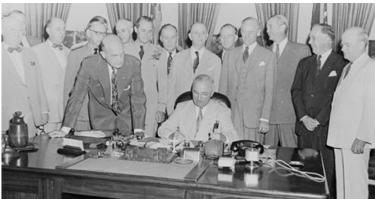
President Harry S. Truman signing off on creation of the CIA.

The immediate target was Soviet Ukraine, which the CIA hoped through its clandestine projects to “crack apart” with saboteurs behind enemy lines.