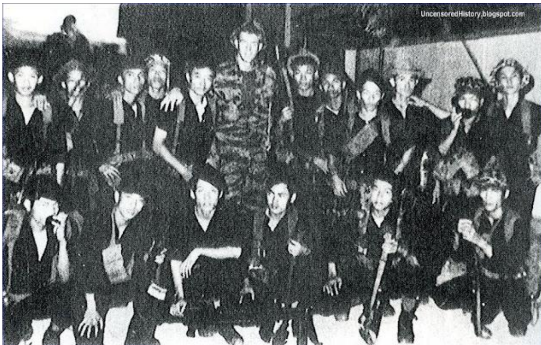
Phoenix Program adviser John Wilbur with local assassination squad.

operation designed to liquidate civilian officials supportive of the National Liberation Front (NLF), which also got out of control and was used to resolve private disputes.