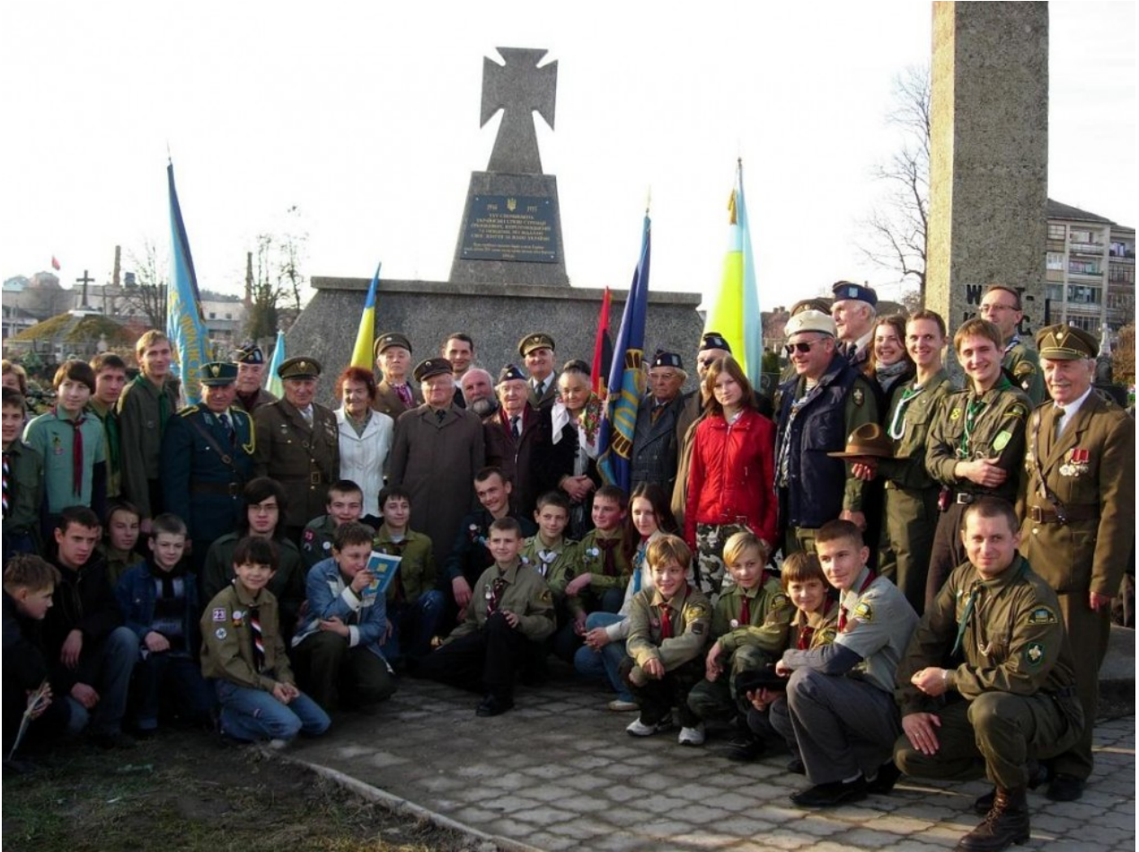
Reunion of SS and UPA Nazi collaborators and their supporters in 2006 in the Ukraine. Civilisation Ukrainian-Style: Vandalising the Memorials to the Soldiers of the Anti-Hitler Coalition

http://02varvara.wordpress.com/2008/11/28/civilisation-ukrainian-style-vandalising-the-memorials-to-the-soldiers-of-the-anti-hitler-coalition/