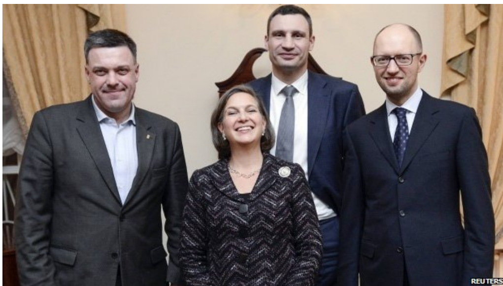
US Assistant Secretary of State Victoria Nuland together with Neo Nazi Svoboda leader Oleh Tyahnybok, left