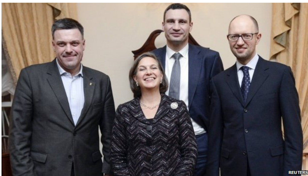
US Assistant Secretary of State Victoria Nuland together with Neo Nazi Svoboda leader Oleh Tyahnybok, left

on the march in Ukraine , Al Jazeera, February 25, 2014