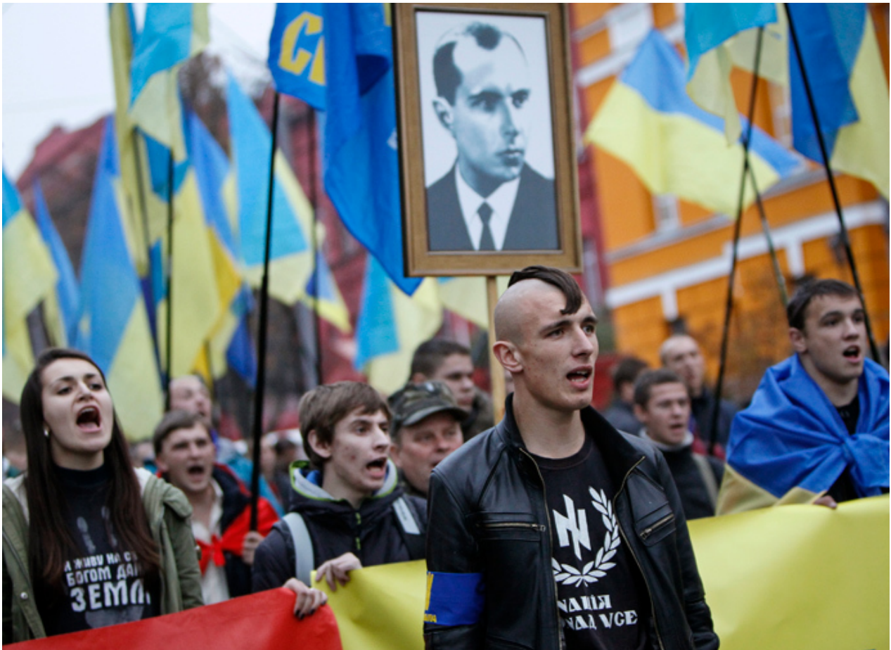
Neo-Nazis Honoring Stepan Bandera

Reports from Kiev confirm that the Jewish community is the target of the Right Sector and the Neo-Nazi Svoboda party, which is supported and financed through various channels by Washington and Brussels: