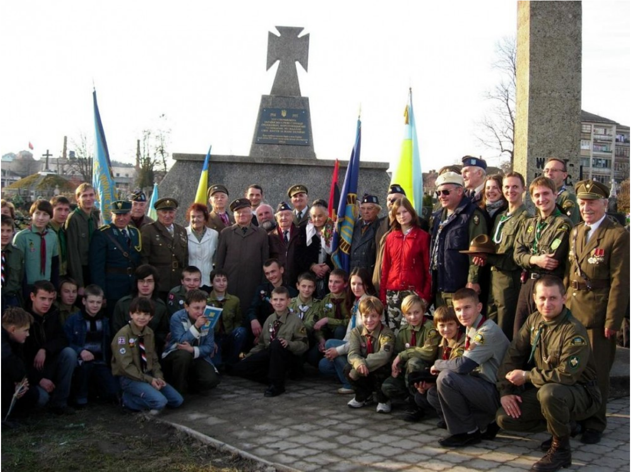
Reunion of SS and UPA Nazi collaborators and their supporters in 2006 in the Ukraine. Civilisation Ukrainian-Style: Vandalising the Memorials to the Soldiers of the Anti-Hitler Coalition

http://02varvara.wordpress.com/2008/11/28/civilisation-ukrainian-style-vandalising-the-memorials-to-the-soldiers-of-the-anti-hitler-coalition/