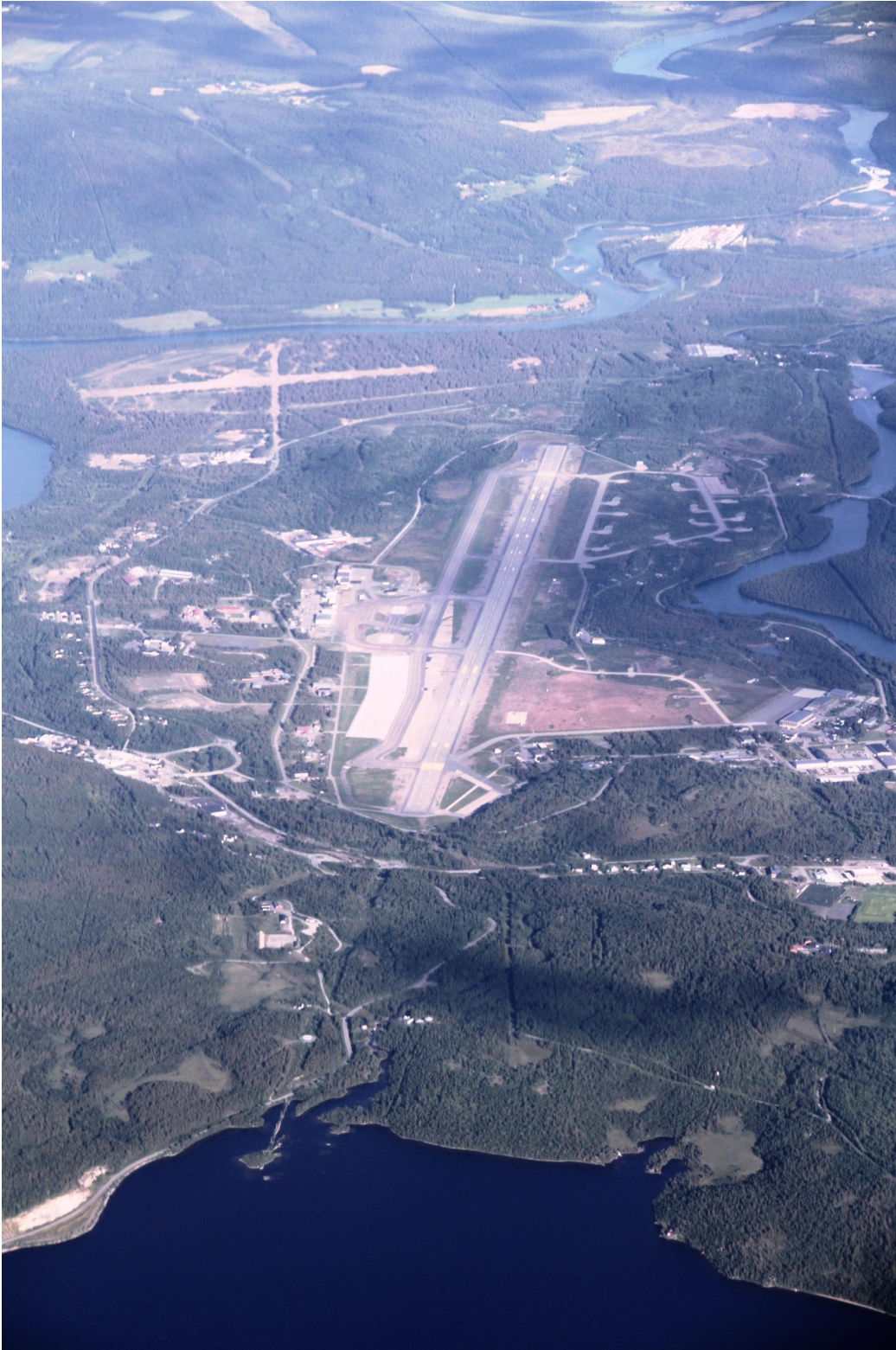
Bardufoss airport and the Andselv town, centre of the municipality of Malselv, Troms (North Norway).