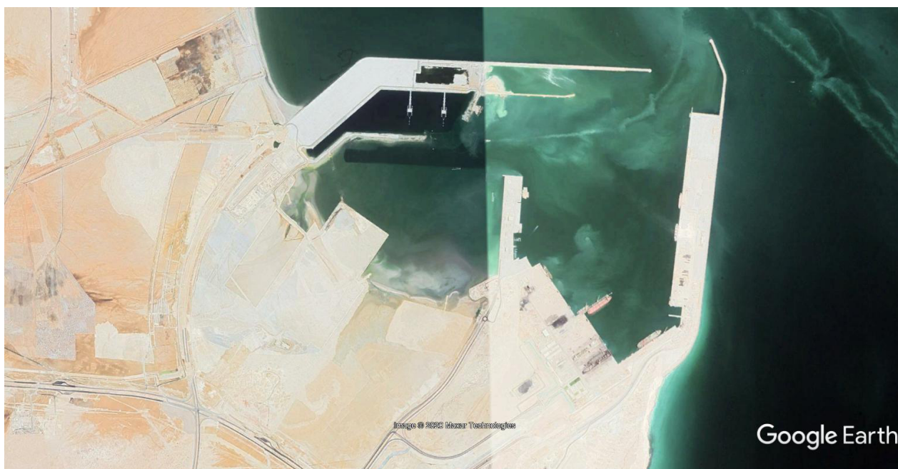
Duqm port expansion, 2009 (top) and 2019 (bottom)