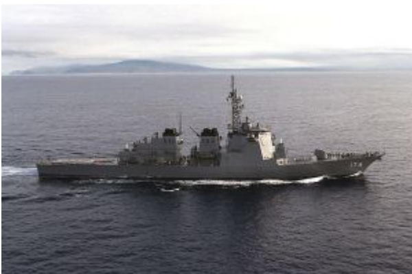
JDS Kirishima Aegis class destroyer

Tokyo's new National Defense Program Guidelines mandate equipping all six of its Aegis class warships with SM-3s as observed earlier.