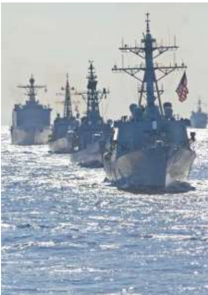
Keen Sword 2011

The South Korean newspaper Hankyoreh also reflected on the groundbreaking Japanese-South Korean military agreements signed on January 10, warning: