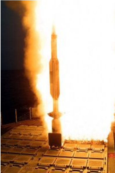
Standard Missile-3 launch

What Japan and the U.S. are collaborating on is the deployment of dozens of SM-3 missiles adapted for land-based deployments (as part of what the U.S. calls the Aegis Ashore program) in Romania, Poland and other nations on and near Russia's western borders.