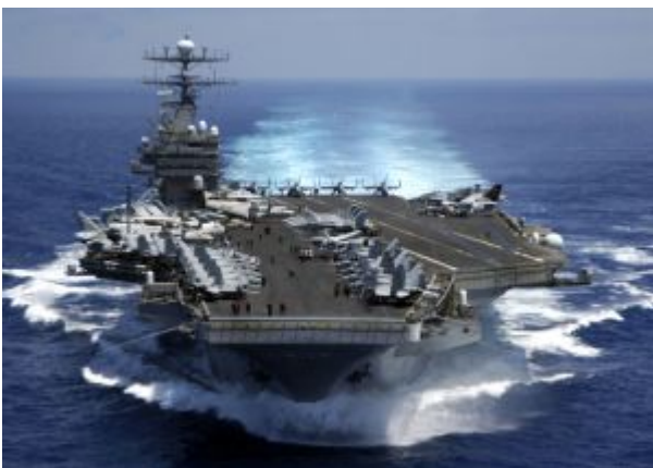
USS Carl Vinson

Last month the U.S. and Japan conducted the latest Keen Sword naval exercise in the East China Sea, which encompasses the disputed Senkaku/Diaoyu islands. It was the largest U.S.-Japanese joint military operation ever held, with 44,000 troops, 400 aircraft and over 60 ships, including USS George Washington. It also (deliberately) corresponded with the half-century anniversary of the U.S.-Japan mutual defense treaty.