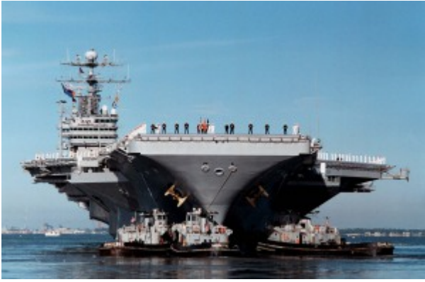
USS George Washington

The USS George Washington nuclear-powered supercarrier and its assigned carrier and expeditionary strike groups have participated in exercises in the Sea of Japan (East Sea), South China Sea, Yellow Sea and East Sea in that interim.