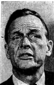
Tom Braden, now a columnist, was first to head propaganda unit.

Continued From Page A1 men may still roam the world, disguised as correspondents for obscure trade journals or business newsletters. The C.I.A.'s propaganda operation was first headed by Tom Braden, who is now a syndicated columnist, and was run for many years by Cord Meyer Jr., a popular campus leader at Yale before he joined the C.I.A. Mr. Braden said in an interview that he had never really been sure that "there was anybody in charge" of the operation and "that Frank Wisner kind of handed it off 'the top of his head.' Mr. Meyer declined to talk about the operation. However, several other former C.I.A. officers said that, while the agency was wary of telling its American journalists what to write, it never hesitated to manipulate the output of its foreign-based "assets." Among those were a number of English-language publications read regularly by American correspondents abroad and by reporters and editors in the United States. Most of the former officers said they had been concerned about but helpless to avoid the potential "slow-back"—the possibility that the C.I.A. propaganda filtered through these assets, some of it noticeably misleading or downright false.