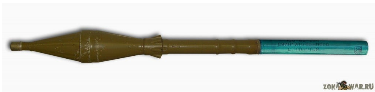
PG 7VM Anti-tank

The total shipment to Aqaba and Agalar is of the order of 994 tons of “humanitarian” R2P light weapons for the “Moderates” in Syria. (in a single shipment out of Romania) among numerous comparable shipments by sea as well as by air.