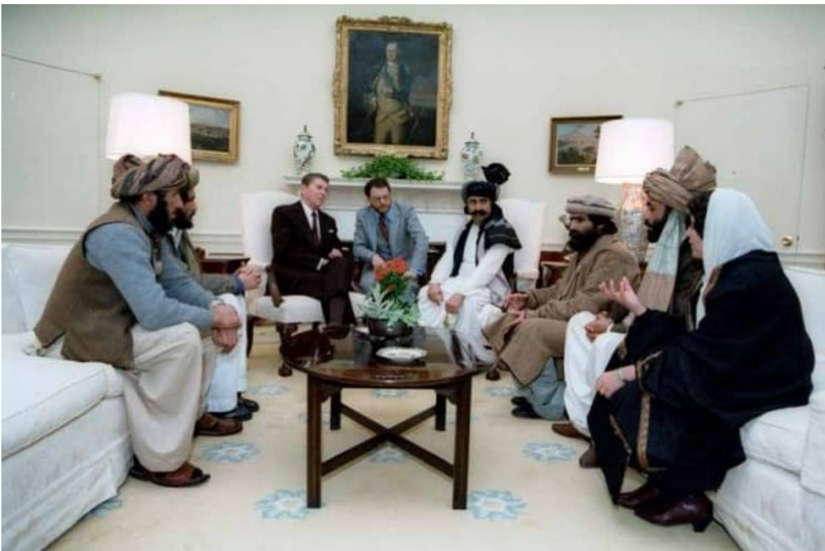
President Reagan and Mujahideen leaders from Afghanistan

Ronald Reagan called the terrorists “freedom fighters”. The US supplied weapons to the Islamic brigades. It was all for “a good cause”: fighting the Soviet Union and regime change, leading to the demise of a secular government in Afghanistan.