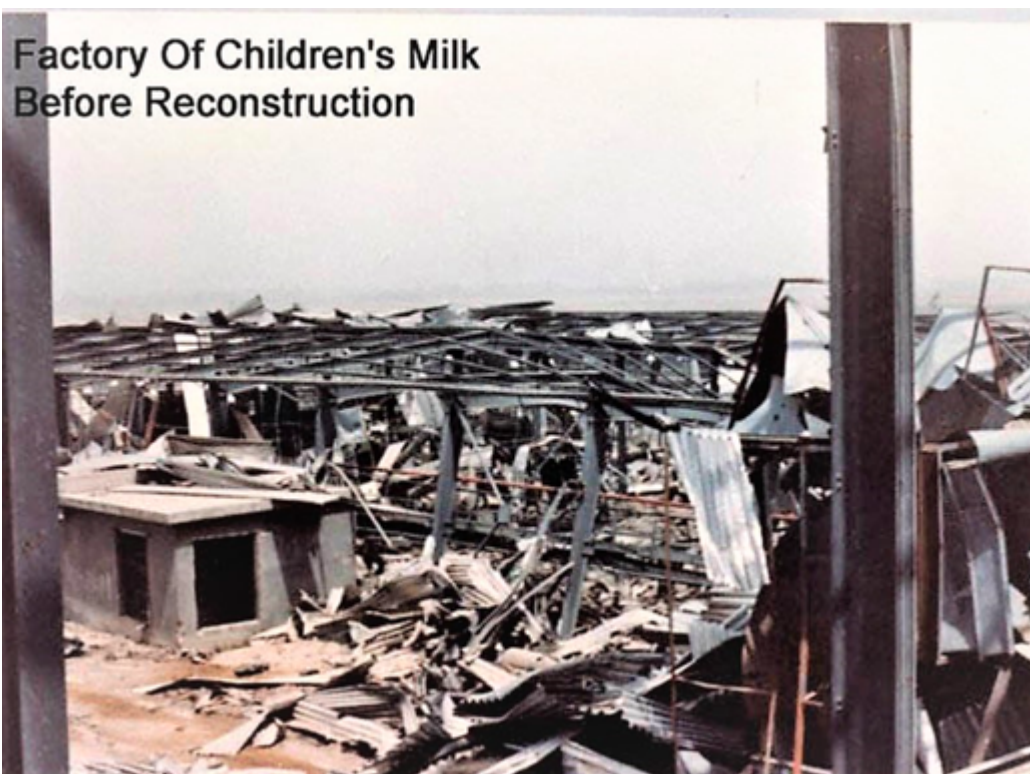
Destruction of Iraq's population infrastructure by American Coalition in Gulf war II, 1991 [3]