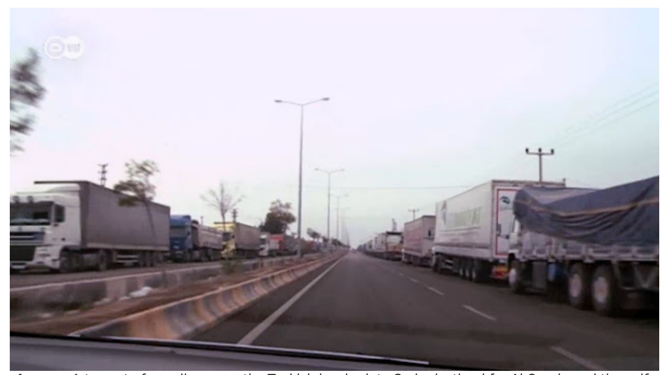
Image: A torrent of supplies cross the Turkish border into Syria destined for Al Qaeda and the self-proclaimed "Islamic State." The US and Turkey have done little to expose this, saying nothing of their inaction to stop it. It was only Russian airstrikes along the border that have finally brought the torrent down to a trickle.

Without President Erdogan's stalwart support, US designs in Syria would have been untenable even before they began. While the US poses as "fighting" terrorist organizations in Syria, it has consistently neglected any attempt to secure the Turkish-Syrian border over which the summation of material support for these terrorist organizations is passing. It must be remembered that not only are the US and Turkey cooperating in regards to Syria, the US has troops stationed within Turkey itself, engaged in various aspects of the ongoing violence in Syria.