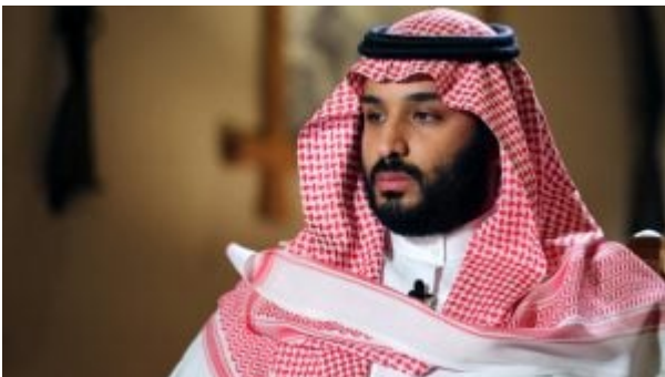
Prince Mohammed Bin Salman

A previous row in 2014 offers additional background. Regional intel operatives confirm at the time there were military Emirati maneuvers not far from the Qatari border; London and Paris, for instance, knew all about it.