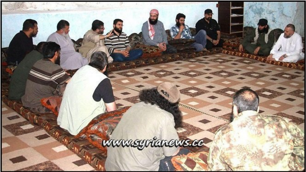
Nusra Front Commander Jolani Meets Commanders of FSA Moderate Rebels in Idlib with help of Erdogan. [ Trump does not know this?]

Saudi Muhaysini is also on the SDN list.