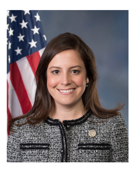
Trump also picked fiery Congresswoman Elise Stefanik (NY) as US ambassador to the United Nations