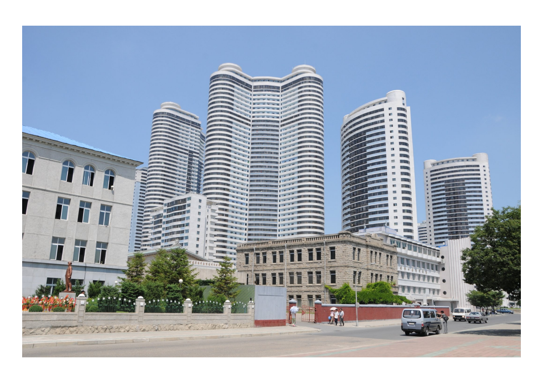
DPRK Free Public Housing

The West has already killed millions of North Koreans. How many more have to vanish, just for not surrendering? What is the price of not agreeing to serve the Empire? Would it be one million more, or ten million? The number, please: you are a businessman; so do define the price truthfully!