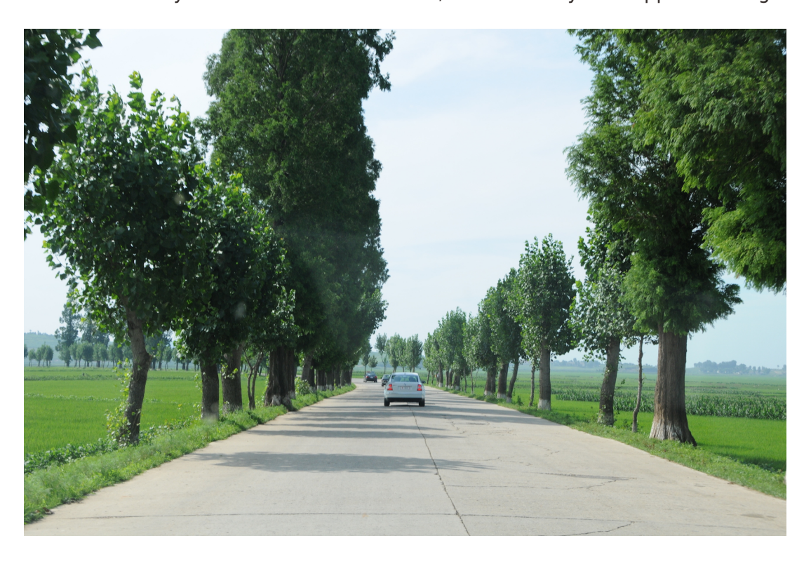
Country road in North Korea

You actually like it, don't you? Admit you do. Let's have it all in the open. And many citizens in the West like it as well – new titillating experiences, free 'entertainment', and a welcome break from the dire and empty, grey, loveless and meaningless routine of daily life in both North America and Europe. Hundreds of millions glued to their TV screens. Your popularity is going down, lately, isn't it? The more missiles you shoot, the more bombs you drop, and the more countries you intimidate and confront, the broader your 'support base' gets.