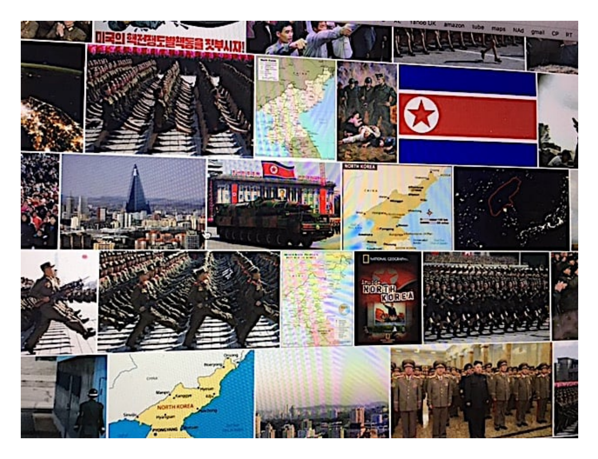
The way the West portrays DPRK.

I have already said a lot about North Korea. I have shown images. I have spoken about the unimaginable pain this country has had to endure. I have spoken broadly about its tremendous gesture – of helping to liberate and then to educate so many parts of the world, including the enormous and devastated continent of Africa.