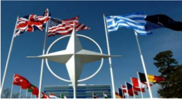
NATO headquarters in Brussels, Belgium.

Here what Ambassador Burns wrote in his summary, which the public knows because the cable was among the thousands leaked to WikiLeaks by Pvt. Bradley (now Chelsea) Manning , for which she was imprisoned for seven years and only recently released (yet the cable has been essentially ignored by the corporate U.S. news media):