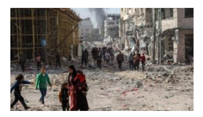
Image: Palestinian families walk through destroyed neighbourhoods in Gaza City on 24 November 2023 as the temporary truce between Hamas and the Israeli army takes effect

Israel threatened all along to do to Lebanon the same as they have done to Gaza. Israeli forces have met fierce resistance, taken heavy casualties, and have not advanced far into Lebanon. But, as in Gaza, they are using bombing and artillery to destroy villages and towns, kill or drive people north and hope to effectively annex the part of Lebanon south of the Litani river as a so-called "buffer zone." When Trump takes office, they may ask for greater U.S. involvement to help them "finish the job."