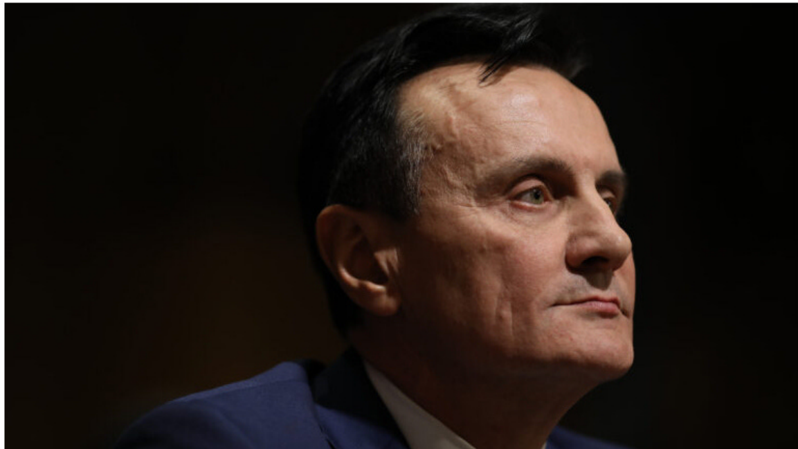
Pascal Soriot, the chief executive officer of AstraZeneca.