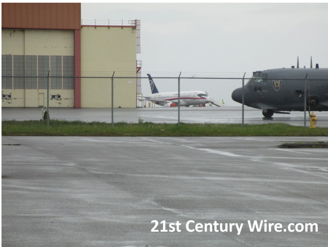
PHOTO: Our man in Iceland took this photo just after 3am last night when this Russian chartered flight landed Keflavik International.

21st Century Wire's Man in Iceland tracked this flight on FlightRadar24.com last night, and followed-up by documenting the plane itself (above) after landing just after 3:00am