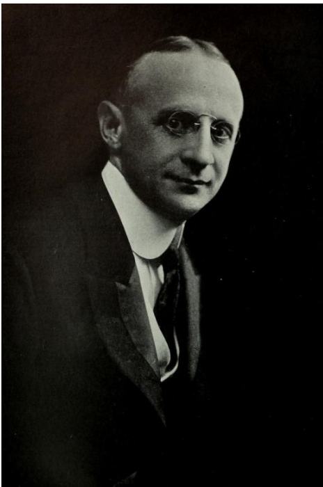
Image on the right: Simon Flexner

As Rockefeller Institute head, Simon Flexner, was publishing his inconclusive but highly acclaimed studies on polio, he arranged for his brother, Abraham Flexner , a school teacher with no medical background, to head a joint study by the American Medical Association (AMA), the Rockefeller General Education Board, and the Carnegie Foundation founded by Rockefeller's close friend Andrew Carnegie.