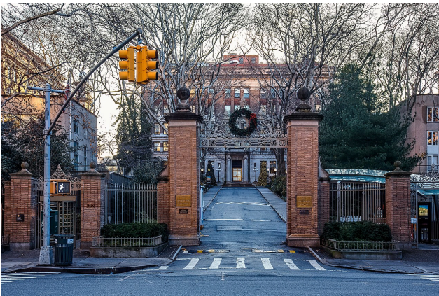
Image below: Rockefeller University Main gates on York Avenue (Licensed under CC BY-SA 4.0)