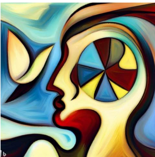
Image: AI-generate image of peace

These are, of course, bits and pieces of global ethics philosophy about which many books have been written. One philosopher among those who have inspired me most is German-American Hans Jonas (1903-1993) , who, in his seminal book, "The Imperative of