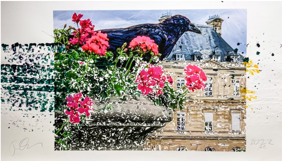
“Paris Bird” 2022

I believe there exists no rational, satisfying solution to the enigma I just posed. But how much closer to the abyss must humankind come before we recognise the necessity and benefit-for-all by pulling together about the big issues and putting away our smaller quarrels?