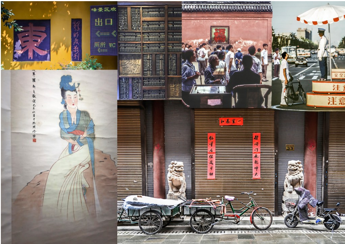
"Xian Collage" 2018 © Jan Oberg

In short, the GRIT theory – developed during the First Cold War and in a way implemented in the Cuban Missile Crisis – is about de-escalation, safe de-escalation. It is extremely important because, today, everybody can blindly take escalatory steps and increase tension until it gets out of control.