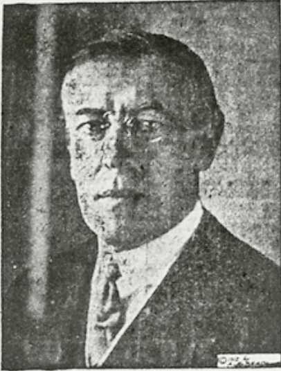
PRESIDENT WOODROW WILSON.

Wilson Declares It the First of Series of Constructive Acts to Aid Business.