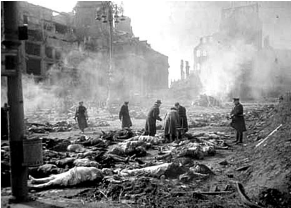
Dresden on the Morning After