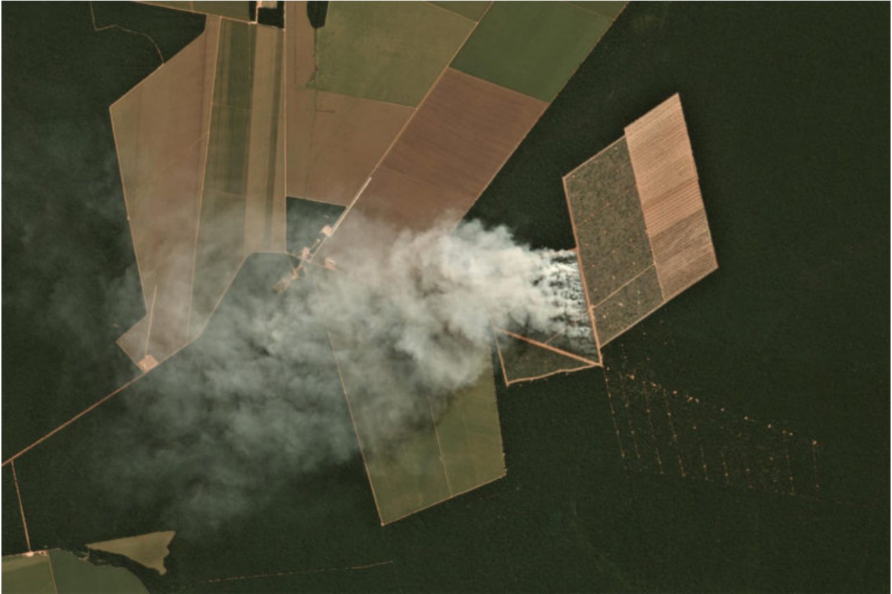
Planet image showing fire on recently deforested land near Itaúba in the State of Mato Grosso, Brazil on June 29, 2020. Fire identified by MAAP.