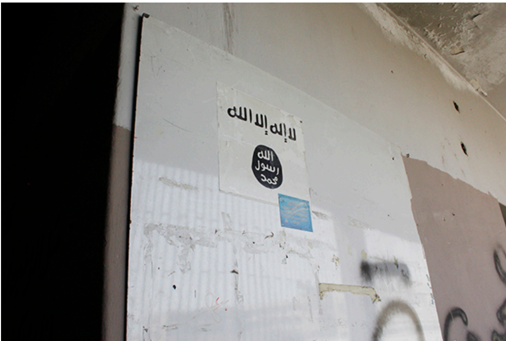
One of many ISIS and Al Nusra insignias and flags found inside the White Helmet facilities, this one in Sakhour, East Aleppo