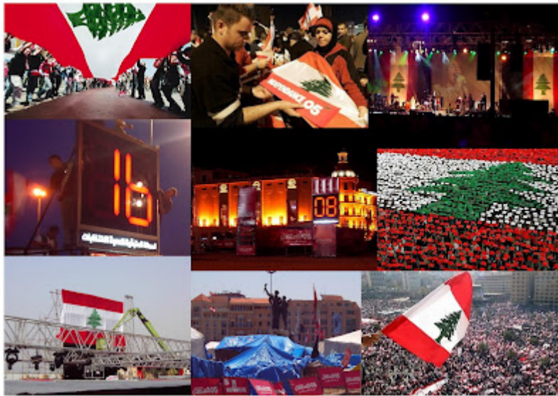
“As illustrated by the images above, Lebanon’s so-called [2005] Cedar Revolution was an expensive, highly-professional production.” (click image to enlarge)

2005: US State Department’s National Endowment for Democracy organizes and implements the “Cedar Revolution” in Lebanon directly aimed at undermining Syrian-Iranian influence in Lebanon in favor of Western-backed proxies, most notably Saad Hariri’s political faction. Counterpunch: “Faking the Case Against Syria,” by Trish Schuh November 19-20, 2005.