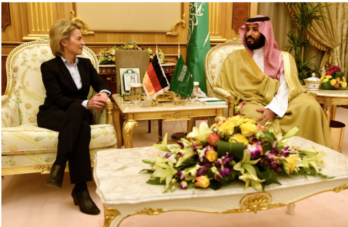
Defence Minister Ursula von der Leyen with her Saudi Arabian counterpart, Mohammad bin Salman Al Saud, in Riyadh.