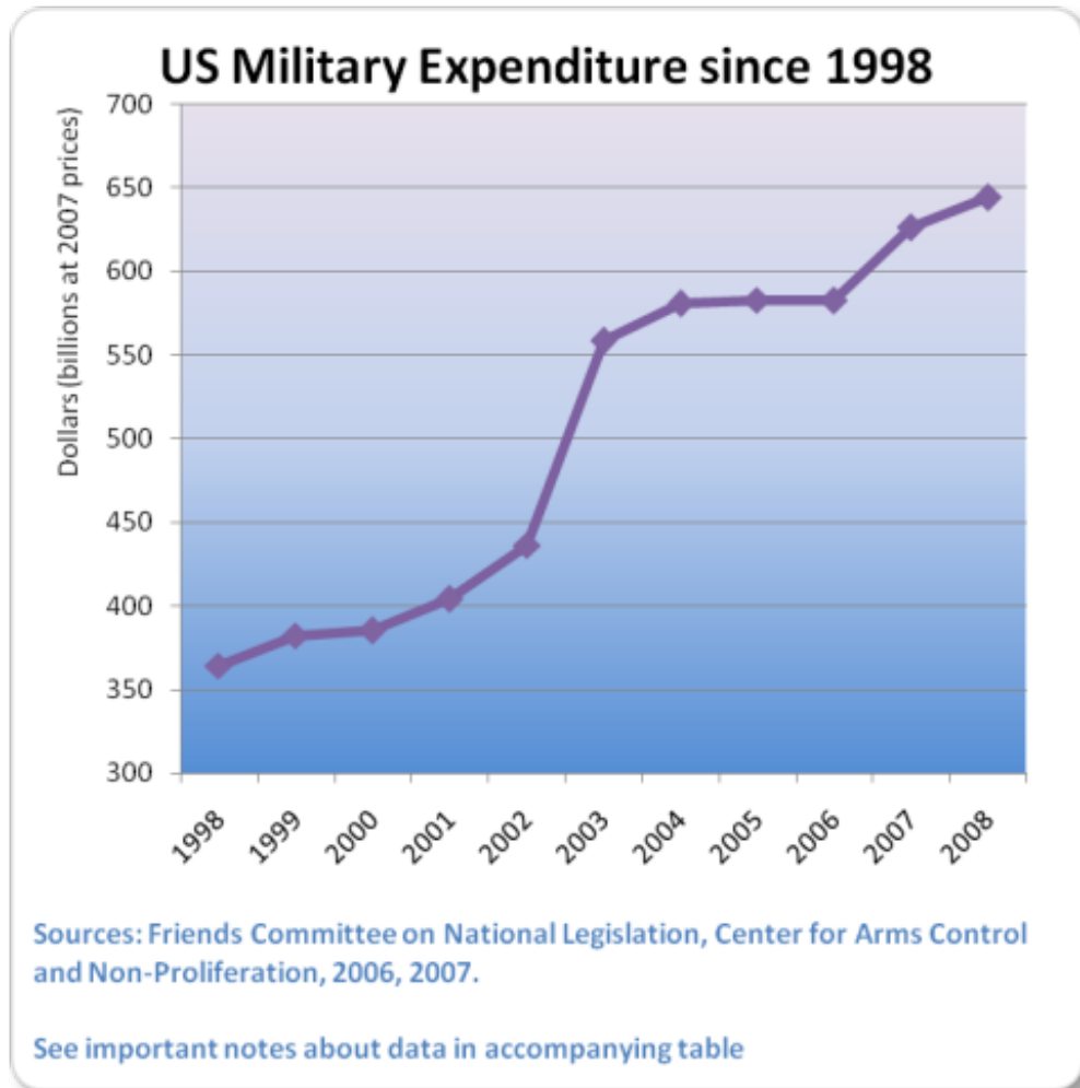
Figure 1. U.S. Military Expenditures since 1998