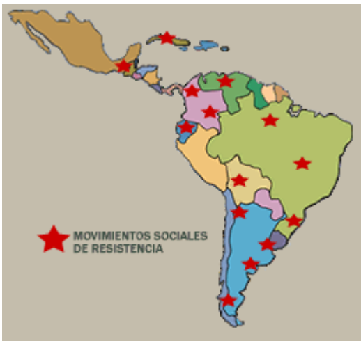
Map 11. Social and Resistance Movements in Latin America