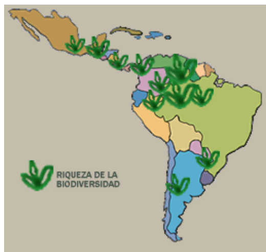
Map 9. The Biological Wealth of Latin America