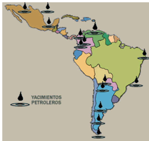
Map 8. Oil Fields in Latin America