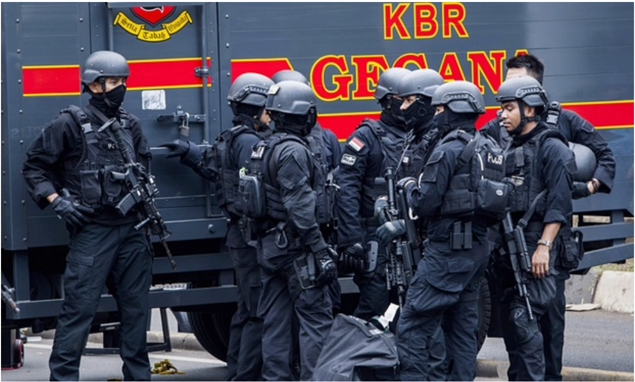
Image: In the aftermath of ISIS attack in Jakarta, Indonesia.

Political impasses in Southeast Asia revolving around America's waning influence in the region have been met with the sudden and otherwise inexplicable appearance of ISIS. In one case, Indonesia signed a large rail deal while pursuing other economic and military partnerships with Beijing, before suffering its first ISIS attack in its capital, Jakarta .