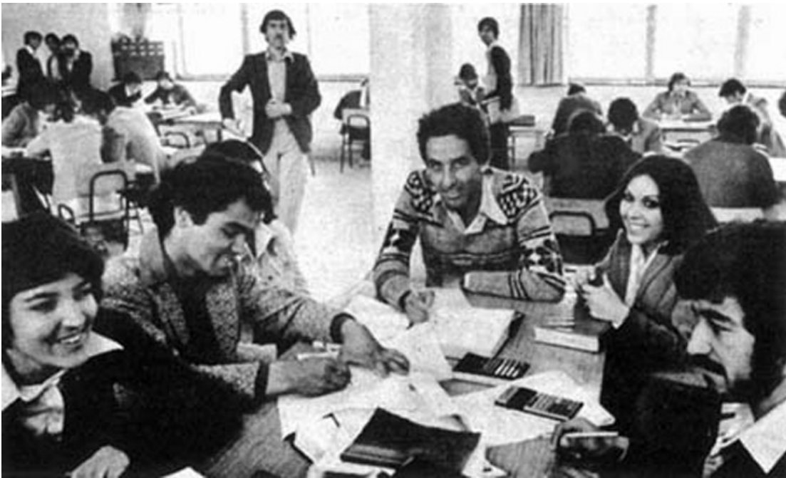
Kabul University early 1980s

All of this was destroyed by continuous US-NATO and CIA interventions going back to 1979. It is a criminal undertaking, it's the destruction of an entire country.