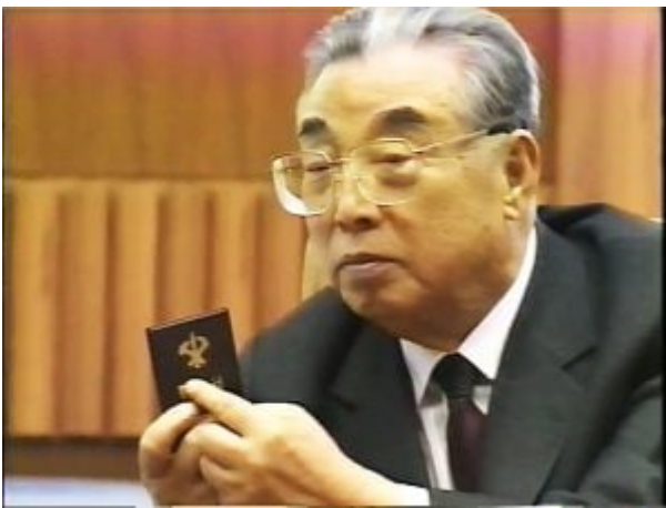
Kim Il-sung

In the Korean Peninsula after the armistice Chinese Volunteer Army and US armed forces remained, one to defend the DPRK and the other to defend the ROK. In 1958 the Chinese army totally withdrew from North Korea, and in 1961 the DPRK succeeded in concluding Treaties of Friendship, Cooperation, and Mutual Assistance with the USSR and China. The treaty with the Soviet Union gave North Korea a nuclear umbrella, so that North Korea could feel its position secure in the face of the San Francisco system.