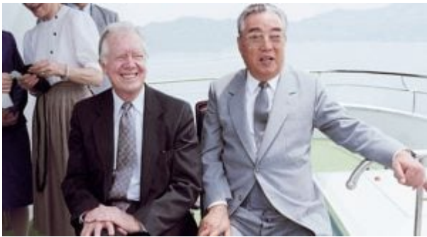
President Kim Il Sung receives former US President Jimmy Carter

The US government had been very sensitive to the North Korean nuclear program and pressed North Korea strongly to accept IAEA inspection. By the spring of 1993 disagreements between the United States and North Korea had become acute, and in the summer of 1994 the two countries came to the brink of war over North Korea's nuclear program. This was the first war crisis between the United States and North Korea.