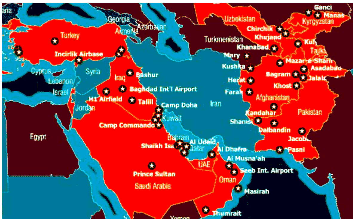
US military bases around Iran.

The US is also fomenting rebellion . The Trump administration has been seeking regime change through various actions including violence . It created a Mission Center in the CIA focused on regime change in Iran and spends millions of dollars to encourage opposition in Iran, working to manipulate protests to support a US agenda. The threat of war continues and becomes ever more likely in an administration dominated by Iran hawks, John Bolton and Mike Pompeo .