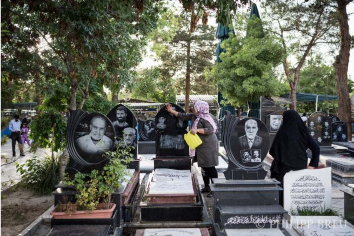
Graves of martyr's from the Iraq-Iran War at the central cemetery of Iran's capital Tehran