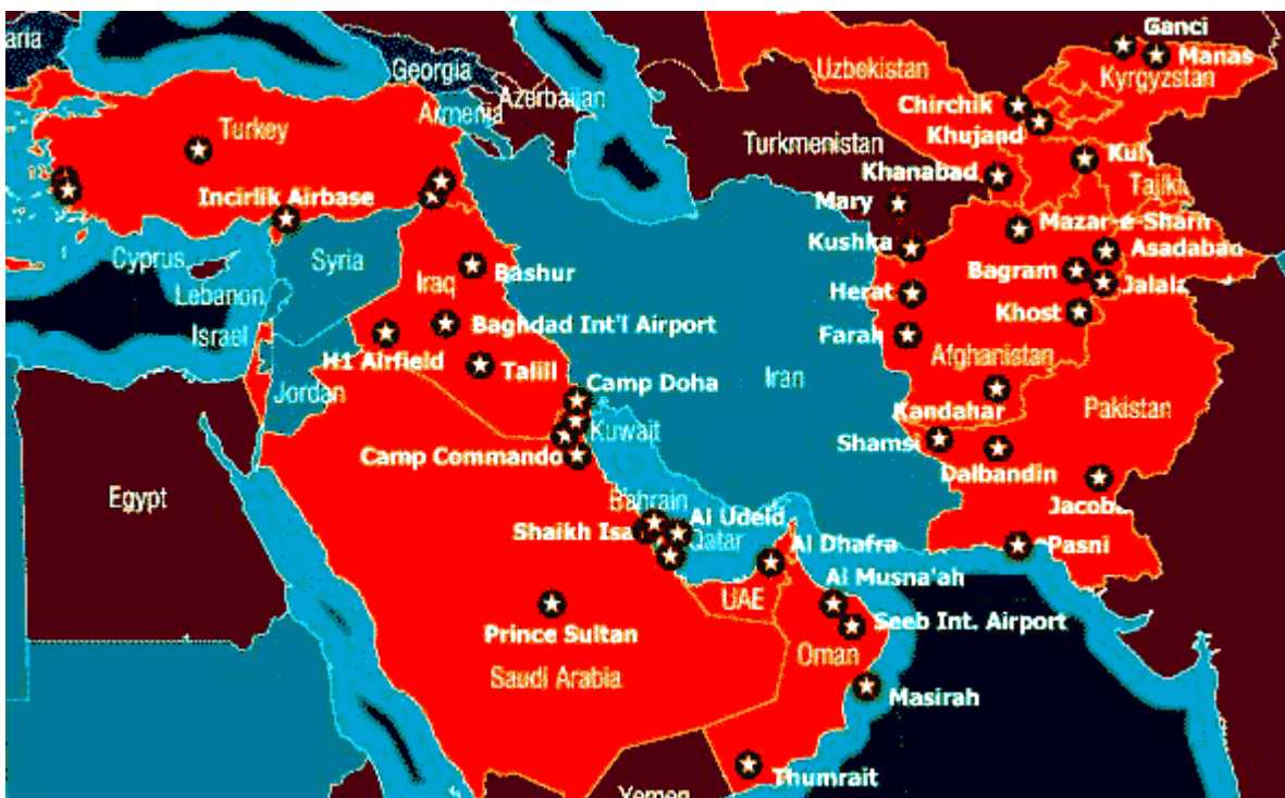
US military bases around Iran.

The US is also fomenting rebellion . The Trump administration has been seeking regime change through various actions including violence . It created a Mission Center in the CIA focused on regime change in Iran and spends millions of dollars to encourage opposition in Iran, working to manipulate protests to support a US agenda. The threat of war continues and becomes ever more likely in an administration dominated by Iran hawks, John Bolton and Mike Pompeo .