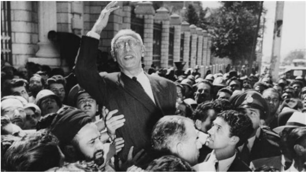
Iran Prime Minister Mohammad Mosaddeq.