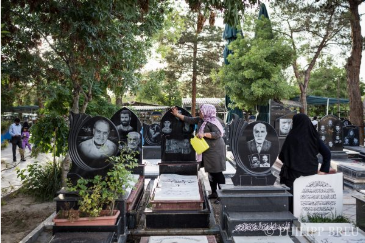
Graves of martyr's from the Iraq-Iran War at the central cemetery of Iran's capital Tehran.