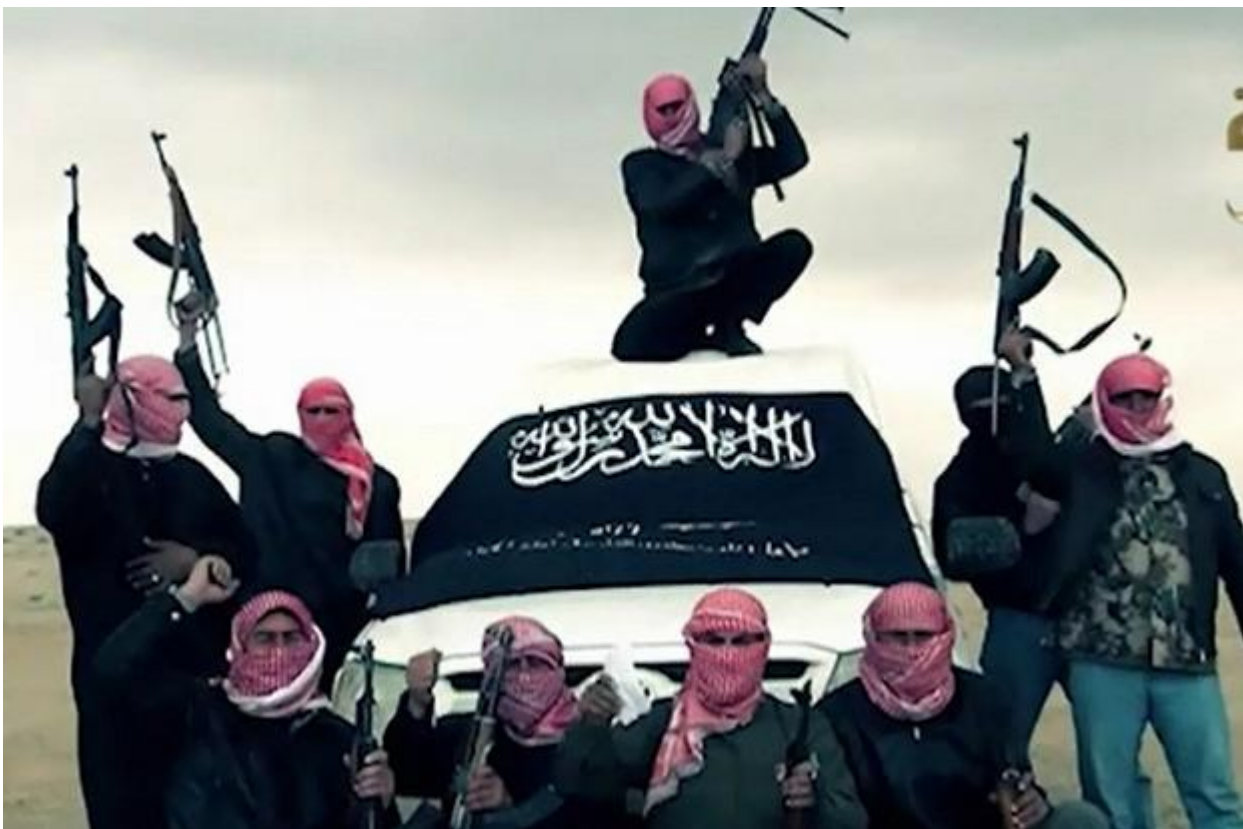
al-Nusra-Front supported by US-NATO-Israel

Western media now claim that Aleppo's citizens are under threat from the Syrian Army, while Syrian sources show civilians, reeling from constant mortar attacks, demanding that the Army roots out all terrorist groups.