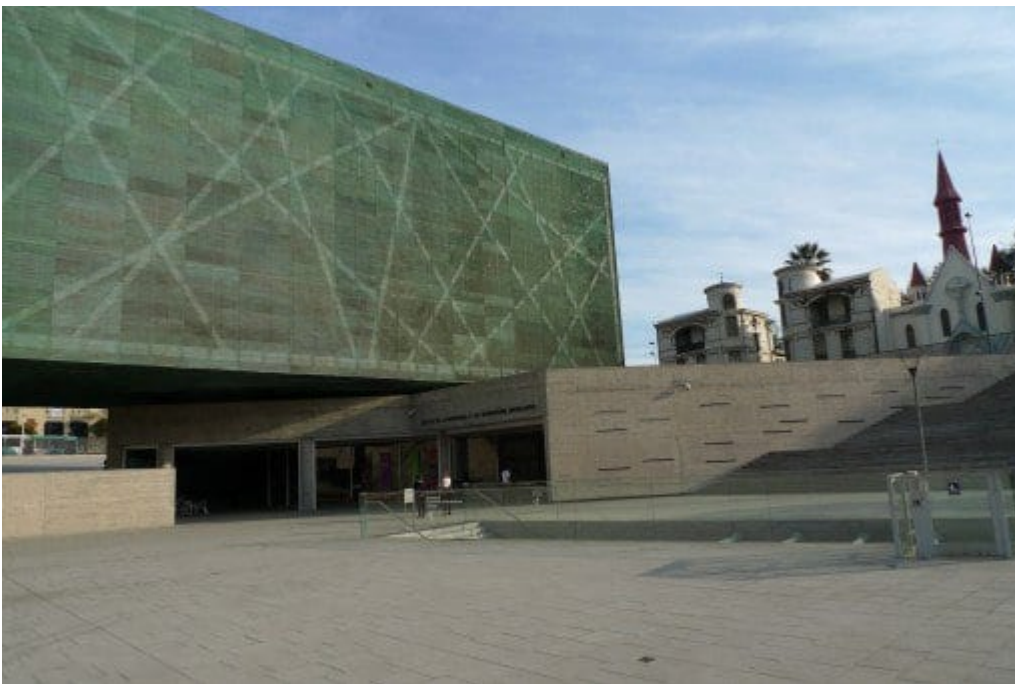
Magnificent Museum of Memory and Human Rights in Santiago (Vltchek)

(Revised 7.15.14. Originally published on 24 November, 2013)