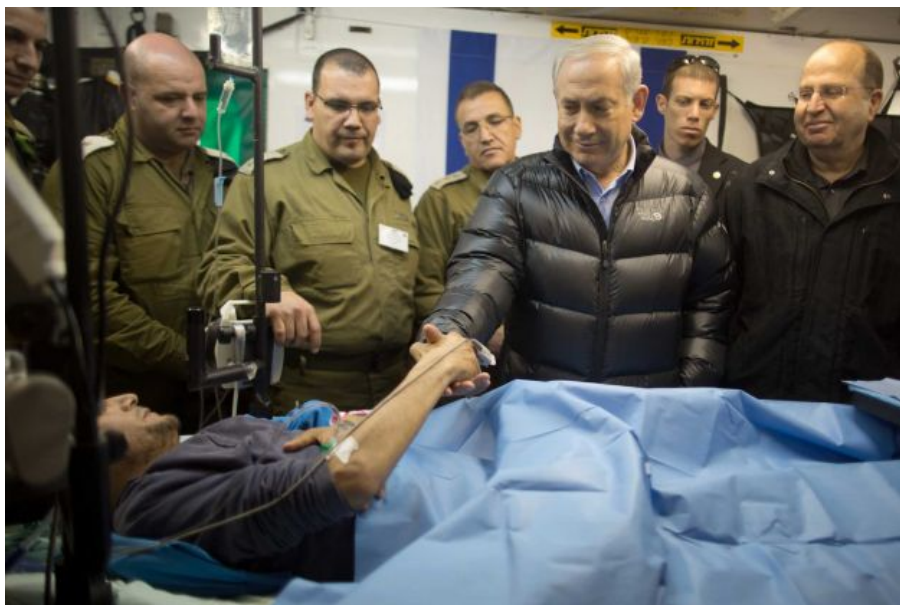
image. “Israeli Prime Minister Benjamin Netanyahu and Defence Minister Moshe Ya’alon next to a wounded mercenary , Israeli military field hospital at the occupied Golan Heights’ border with Syria, 18 February 2014”.

Jihadist fighters have met Israeli IDF officers as well as Prime Minister Netanyahu. The IDF top brass acknowledges that “global jihad elements inside Syria” [ISIL and Al Nusrah] are supported by State of Israel.