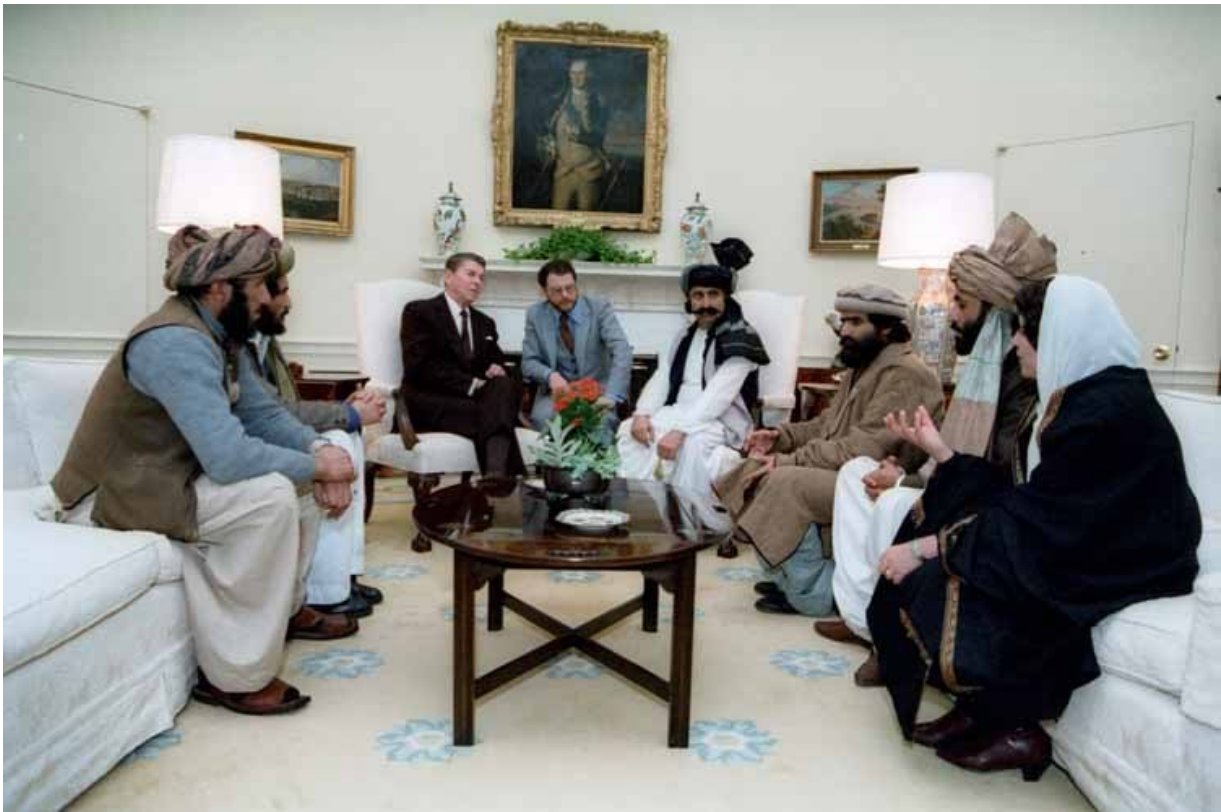
Ronald Reagan meets Afghan Mujahideen Commanders at the White House in 1985