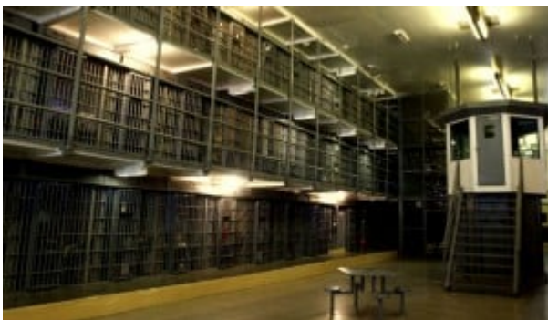
Arizona State Prison Cell Block