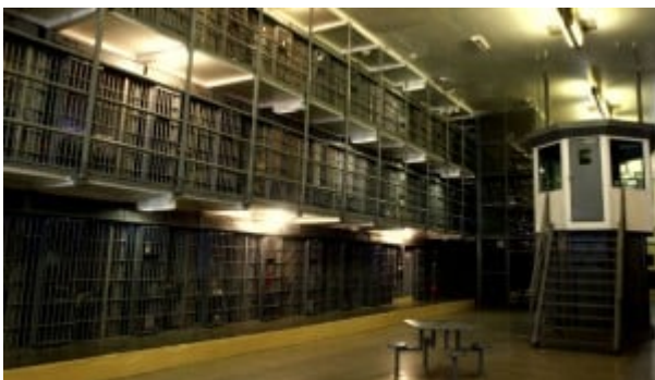
Arizona State Prison Cell Block