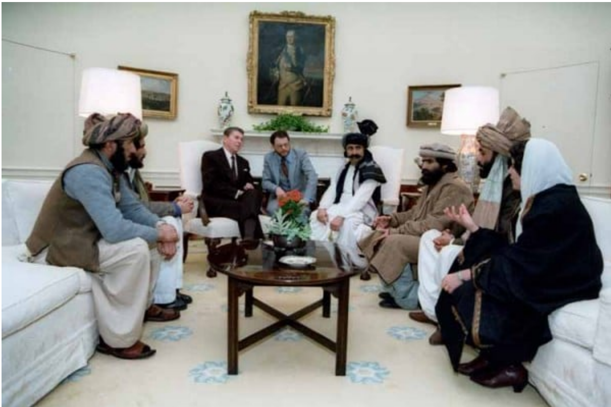
President Reagan and Mujahideen leaders from Afghanistan

The Central Intelligence Agency (CIA) using Pakistan's military Inter-Services Intelligence (ISI) played a key role in training the Mujahideen. In turn, the CIA sponsored guerrilla training was integrated with the teachings of Islam: