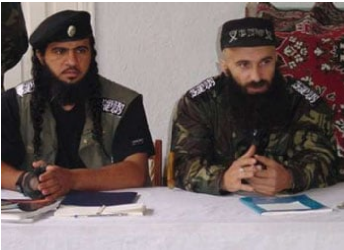
Chechnya's rebel leaders Shamil Basayev and Al Khattab