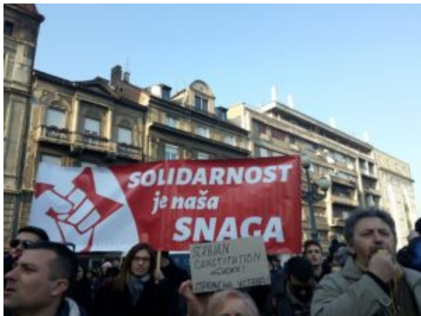
Belgrade protests, February 15, 2017

For the left, this renewed instability opens up possibilities. Unfortunately, the majority of those organising protests in Serbia have already come out for the main liberal candidate, Saša Janković. The other liberal is ex-UN head of the General Assembly, Vuk Jeremić, who may yet be seen as a more credible candidate against Vučić. The liberal opposition remains divided and unstable.