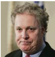
Quebec Premier. Premier Ministre Jean Charest