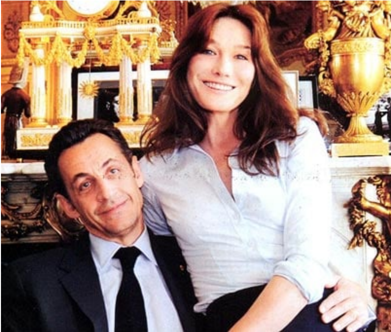
President Sarkozy with his wife Carla Bruni

The prank phone call to Governor Palin ended with the “Fake Sarkozy” referring to a controversial Hustler pornographic movie, produced by Larry Flynt featuring “a Palin look-alike” . The movie is to be launched by Hustler Video .