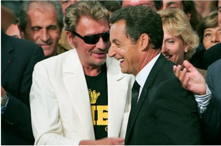
French pop-star Johnny Hallyday with President Nicolas Sarkozy

FAKE SARKOZY: Excellent, are you confident?