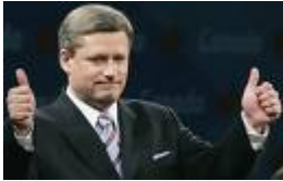
Canadian Prime Minister Stephen Harper