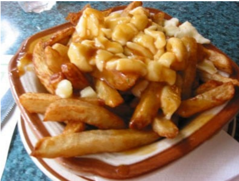
Quebec's Poutine: French fries, Gravy and Cheese Curd

Moreover, Poutine [Putin] is the name of then president of the Russian Federation, Vladimir Putin (In French Vladimir Poutine). Currently Putin is Russia's Prime Minister, not to be confused with Québec's favorite fast food.