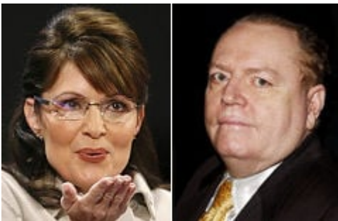
Sarah Palin and Larry Flynt, producer of Hustler’s “Nailin’ Palin” “The documentary they made on your life”

The prank phone call to Governor Palin ended with the “Fake Sarkozy” referring to a controversial Hustler pornographic movie, produced by Larry Flynt featuring “a Palin look-alike” . The movie is to be launched by Hustler Video .