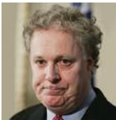
Quebec Premier. Premier Ministre Jean Charest